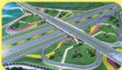
Outer Ring Road