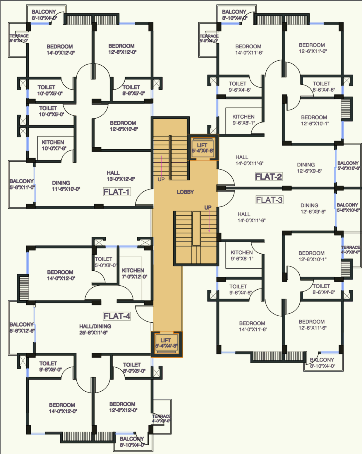
TYPICAL 3RD & 6TH FLOOR