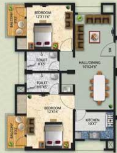
FLAT TYPE B & E

TYPICAL 1ST TO 7TH FLOOR S.B.A-1155 SQFT BHK-2