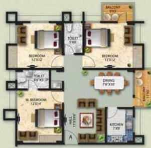
FLAT TYPE A

TYPICAL 1ST TO 7TH FLOOR S.B.A-1450 SQFT BHK-3