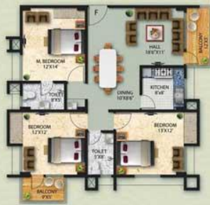
FLAT TYPE F

TYPICAL 1ST TO 7TH FLOOR S.B.A-1450 SQFT | BHK-3