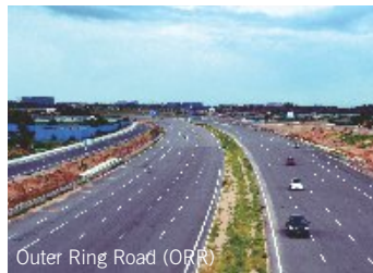
Outer Ring Road (ORR)