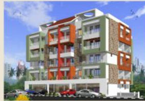
WESTGATE VENEZIA Valencia, Mangalore