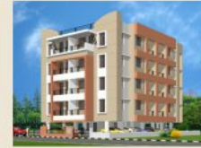
WESTGATE ADEENA RESIDENCY Morgansgate, Mangalore