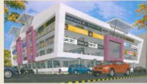
EXCEL MALL K. S. Rao Road, Mangalore