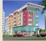
WESTGATE HEIGHTS Falnir, Mangalore