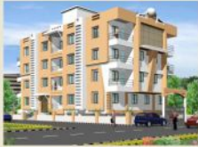
WESTGATE RAHIL RESIDENCY Falnir, Mangalore