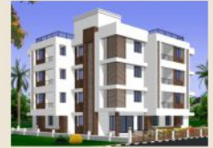
WESTGATE TERRACES Pandeshwar - Mangalore