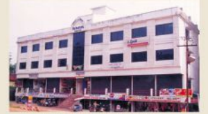
WESTGATE CENTRE Pumpwell, Mangalore