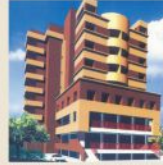
WESTGATE PRIDE Falnir, Mangalore