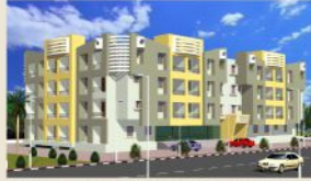
WESTGATE LIYANA RESIDENCY Jeppu, Mangalore