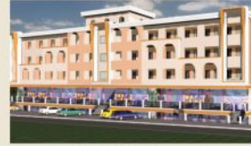
WESTGATE AVENUE Deralakatte, Mangalore