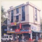
ZAINABA ARCADE Falnir, Mangalore