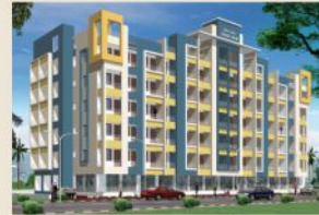
WESTGATE RIVER VIEW Jeppina Mogaru, Mangalore