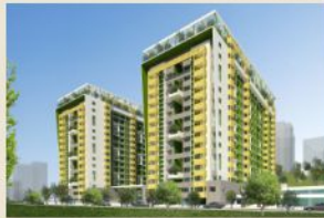
WESTGATE GARDENS Padil, Mangalore