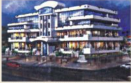
WESTGATE TERMINUS Falnir, Mangalore