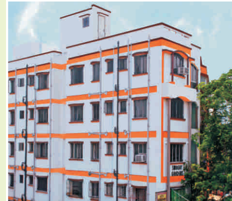
SWAGAT GARDENS, Baguiati