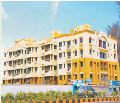
SWAGAT CHINAR, Chinar Park