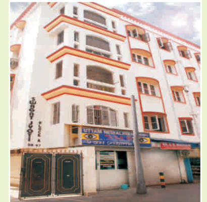
SWAGAT JYOTI, Baguiati