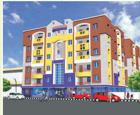
SWAGAT AASHIYANA Narayanpur, Rajarhat