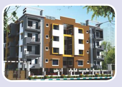
SAFFRON'S GREEN GOLD Sri Sathurvethy Nagar, Sanganoor Road, Ganapathy, Coimbatore