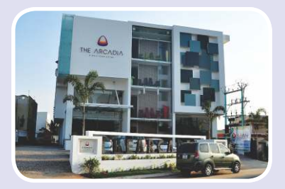
THE ARCADIA HOTEL Opp. KMCH, Avinashi Road, Coimbatore