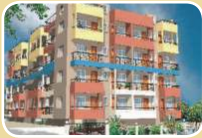
SAFFRON'S DEWDROPS Ponnaiarapuram, R.S.Puram, Coimbatore