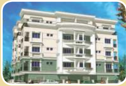
K.C'S JASMINE Bharathi Park 8th Cross Road Saibaba Colony, Coimbatore-11