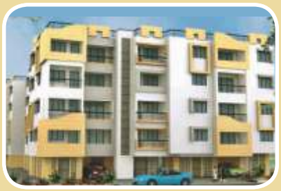
SAFFRON'S BUDS - Veda Block 1 Nanjundapuram Main Road Ramanathapuram, Coimbatore