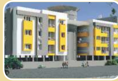
SAFFRON'S SILVER SPRING Avinashi Main Road Opp to KMCH, Coimbatore