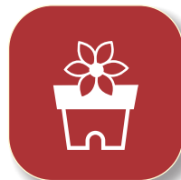
Greenery & Plants