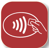
Access Card Entry

NOTE : Saleable are includes plinth area of the Apartment, including walls and external finish, Utility area, balconies and a proportionate share of all common areas, common amenities and service, Whilst every care has been taken in the preparation of this brochure, the promoter (s) reserve their rights to make alterations, amendments including additional constructions on the building / property as may be necessitated / permitted from time to time. The promoter(s) reserve the rights to add / delete any facility, specification or amenity at the time of execution of the agreement of sale of the apartment. This brochure does not form any inclusion in the legal documents and purely for information only.