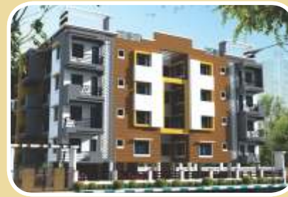
SAFFRON'S GREEN GOLD Sri Sathurvethy Nagar, Sanganoor Road, Ganapathy, Coimbatore