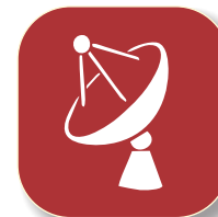
Dish TV Connection