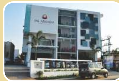
THE ARCADIA HOTEL Opp. KMCH, Avinashi Road, Coimbatore