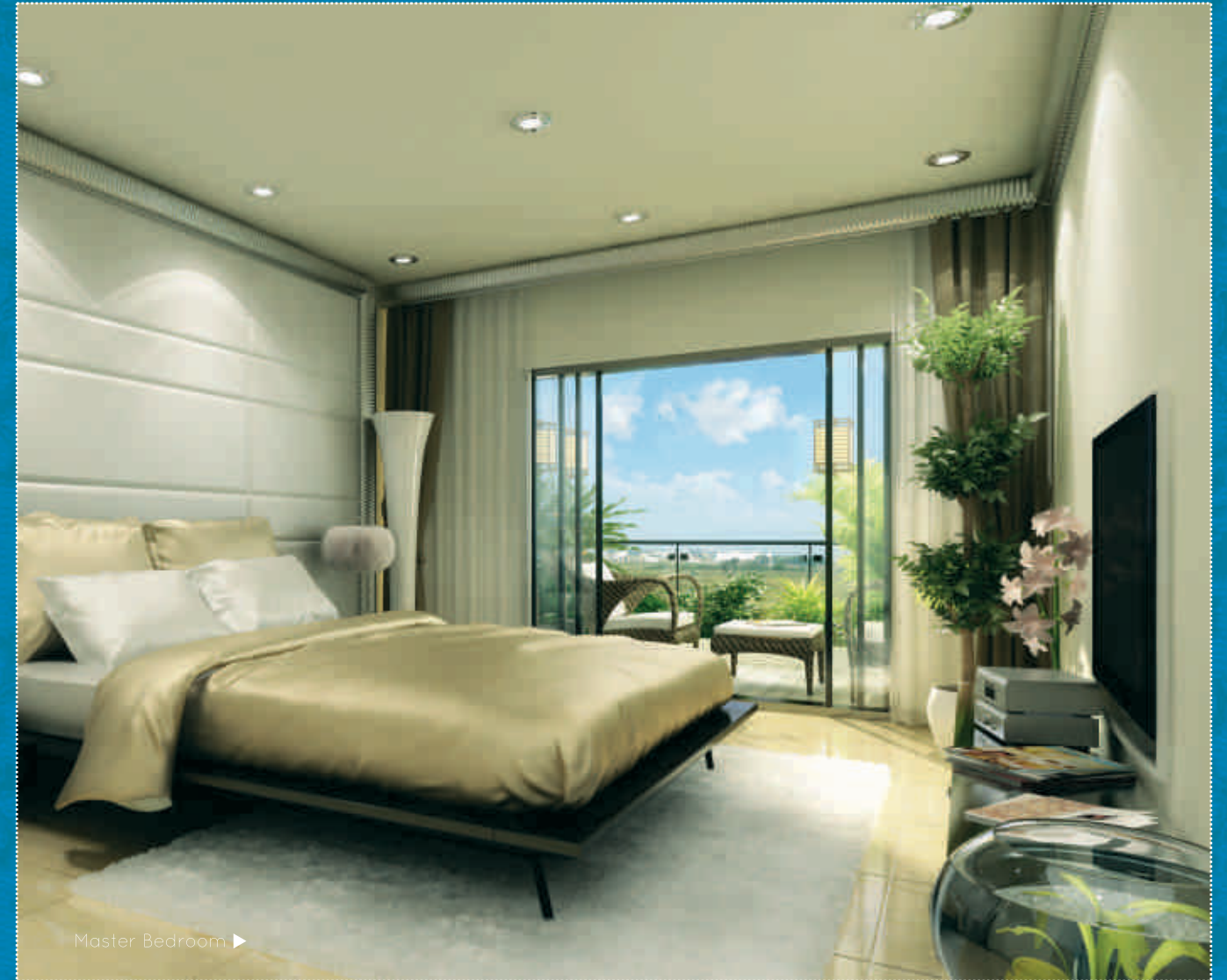
Master Bedroom ▶

Homes in Ekaant are plush large living spaces full of natural light and breeze. The perfect way to unwind after a busy day.