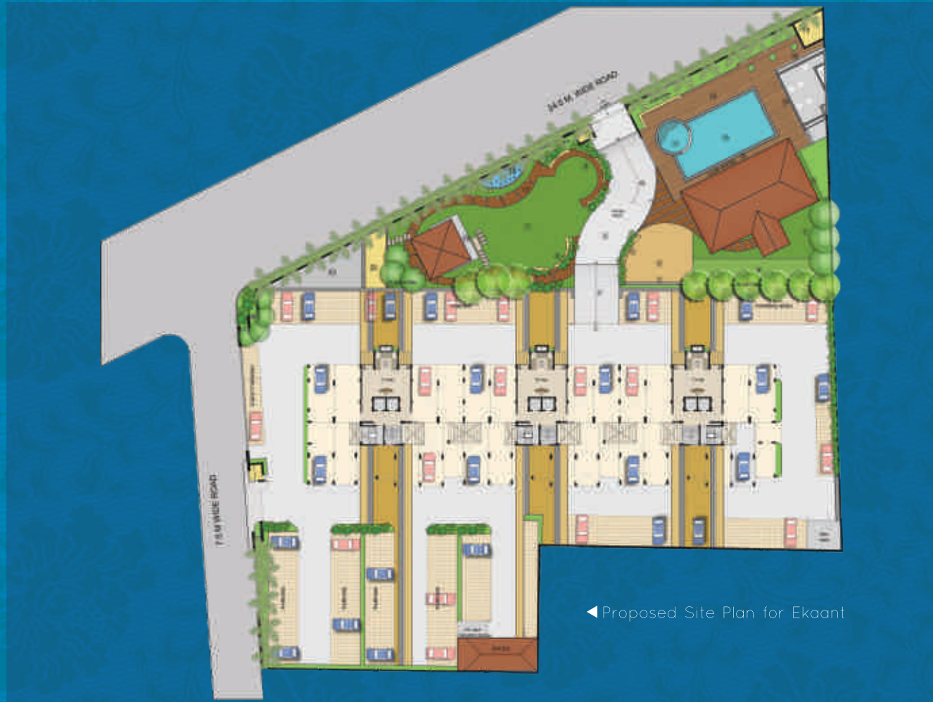
◀ Proposed Site Plan for Ekaant