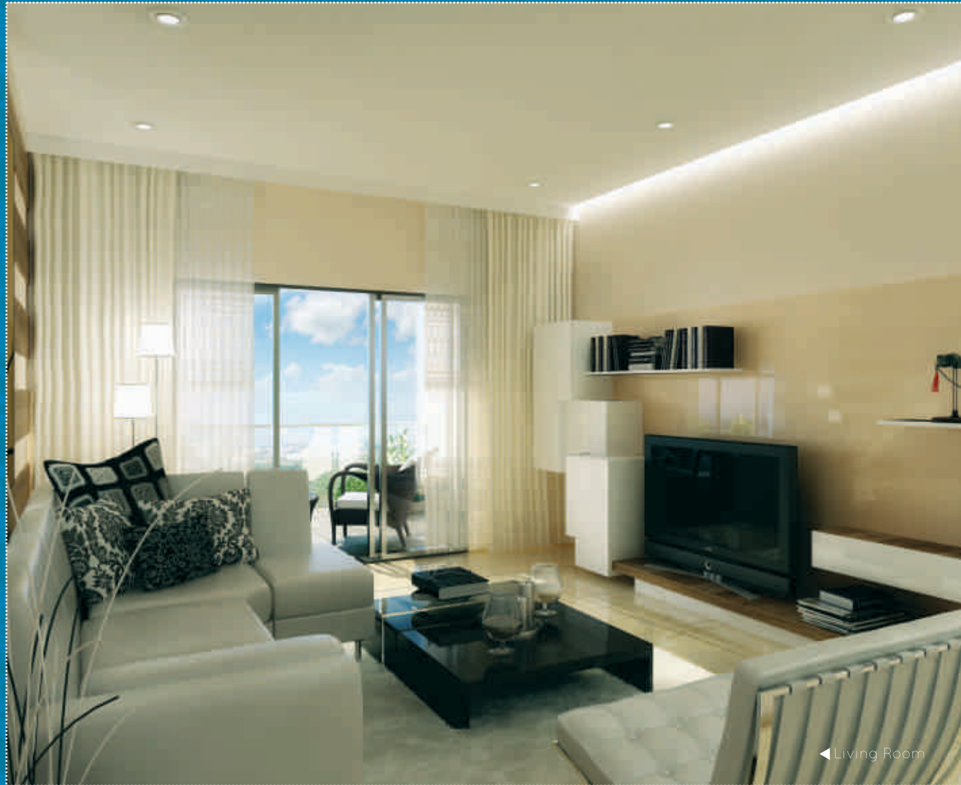
◀ Living Room