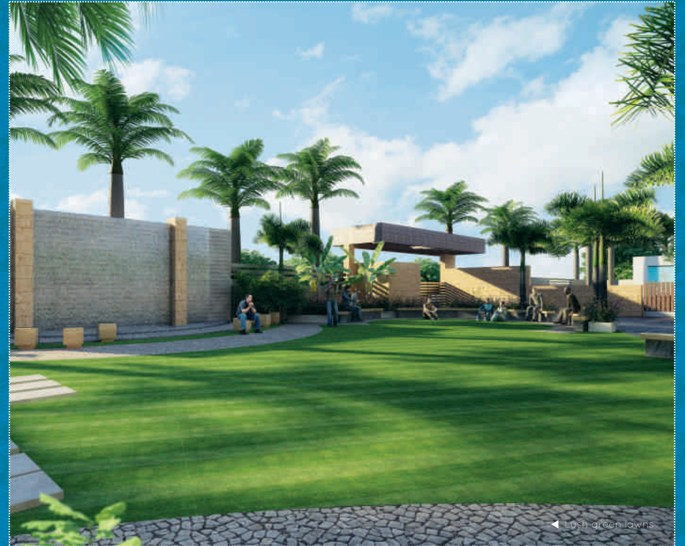
◀ Lush green lawns

Ekaant boasts of its very own private library within the premise. Your very own time of blissful solitude.