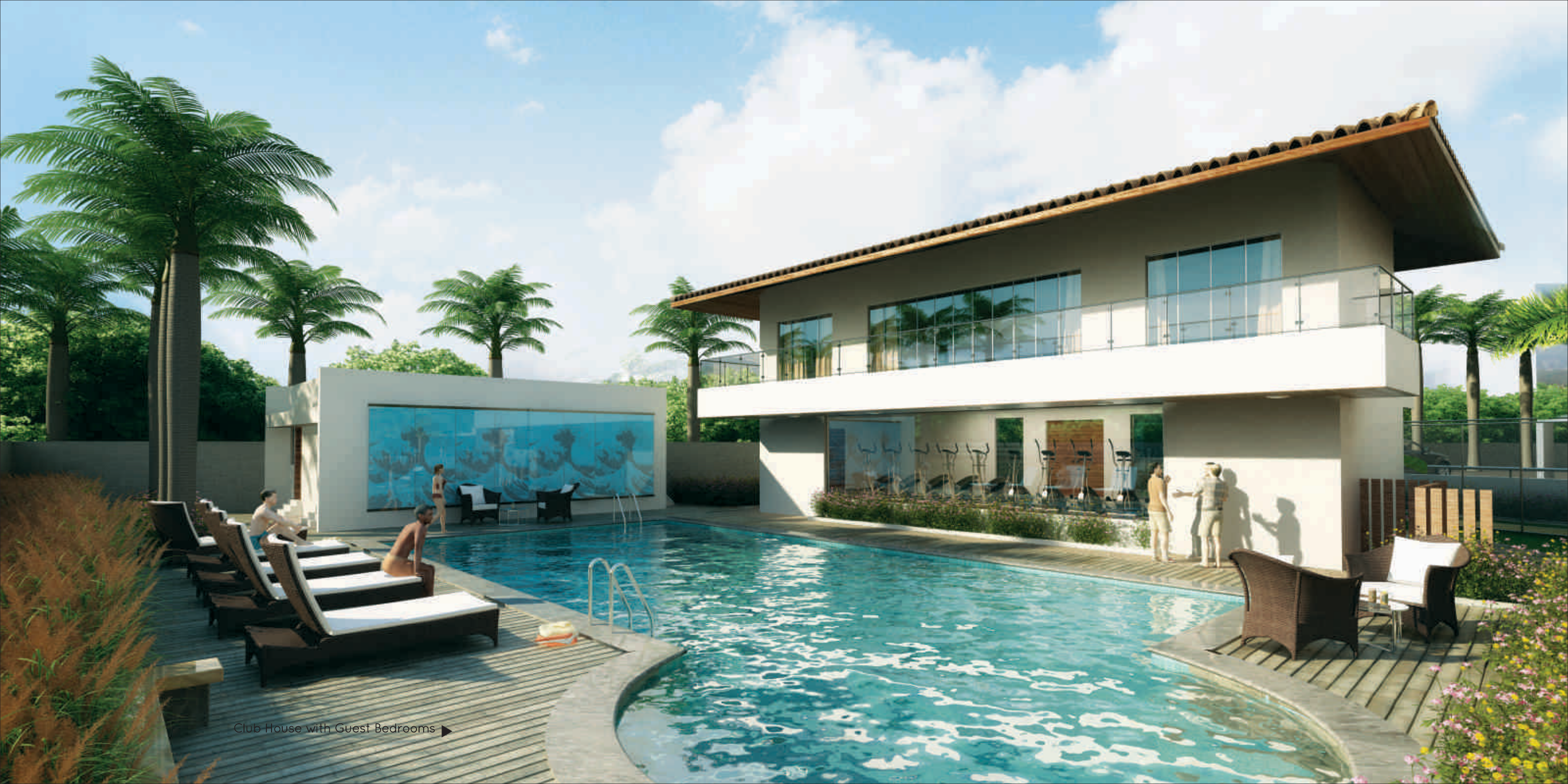
Club House with Guest Bedrooms ▶