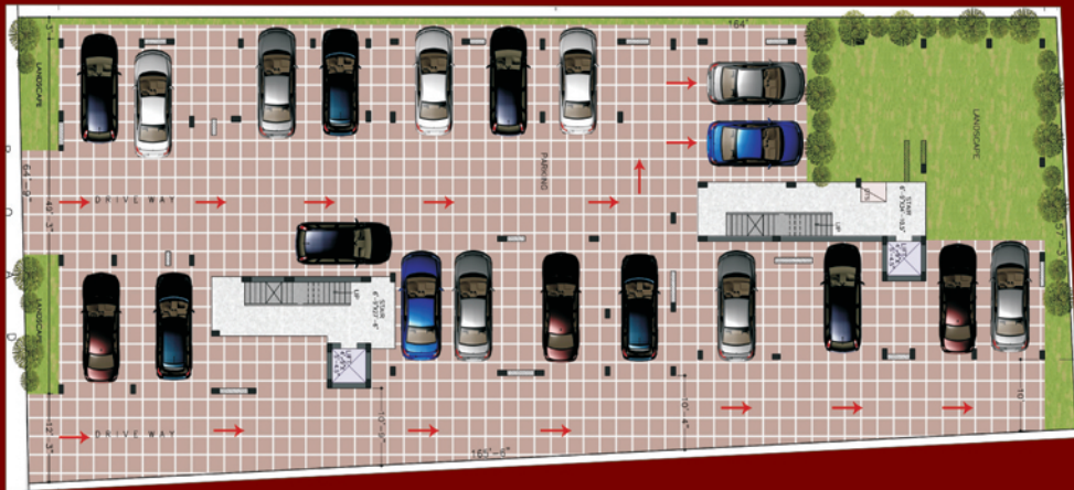
STILT FLOOR PLAN