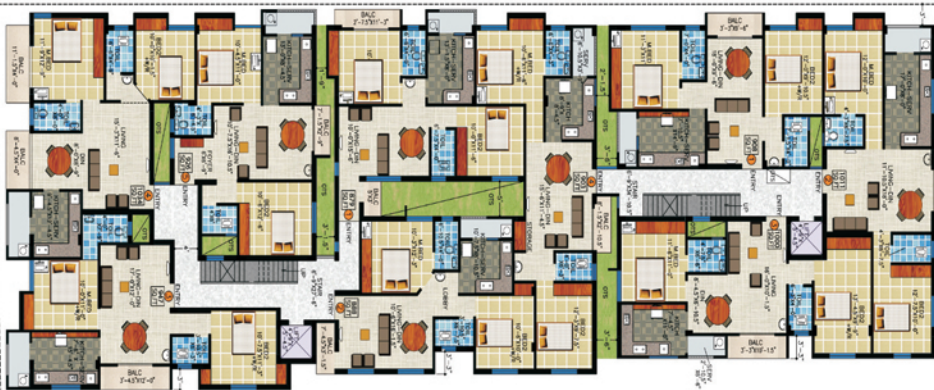
FIRST & SECOND FLOOR PLAN (TYPICAL)