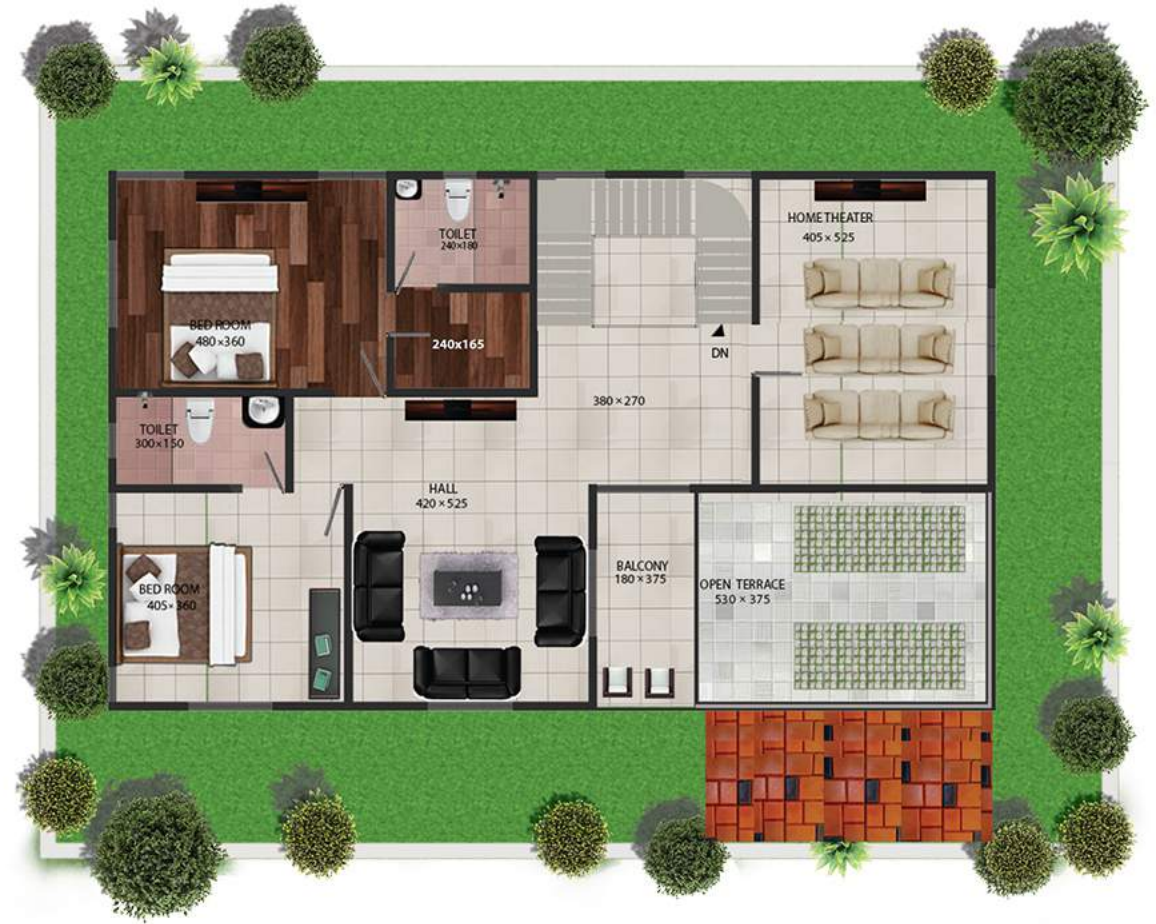
TYPE : B 1st Floor: 1367 sq.ft. Total Built-Up Area : 2999 sq.ft.