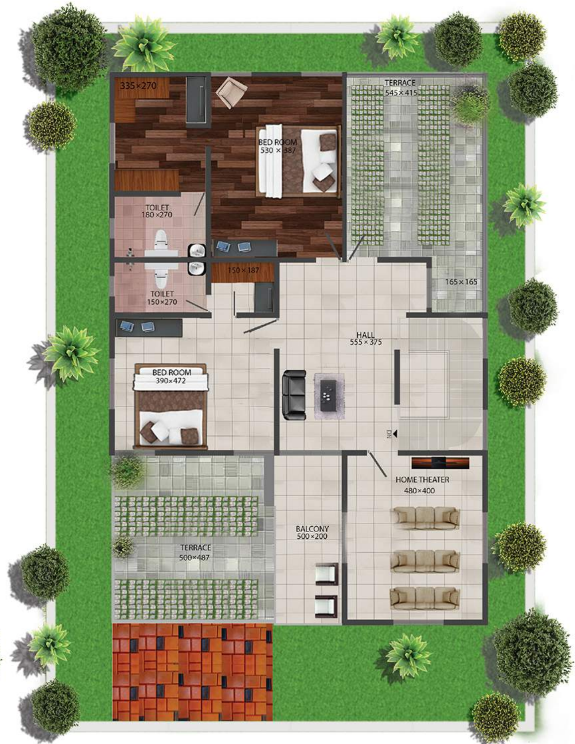
TYPE : D 1st Floor: 1425 sq.ft. Total Built-Up Area : 3385 sq.ft.