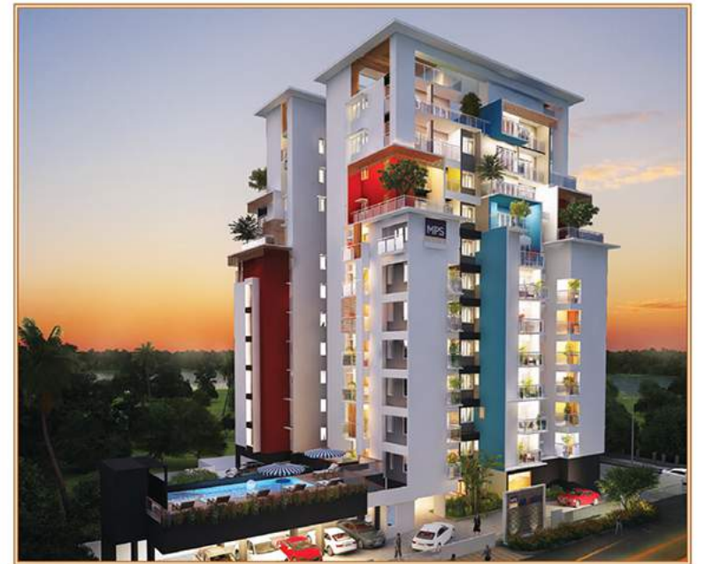
MPS Absolut Vytilla, Ernakulam