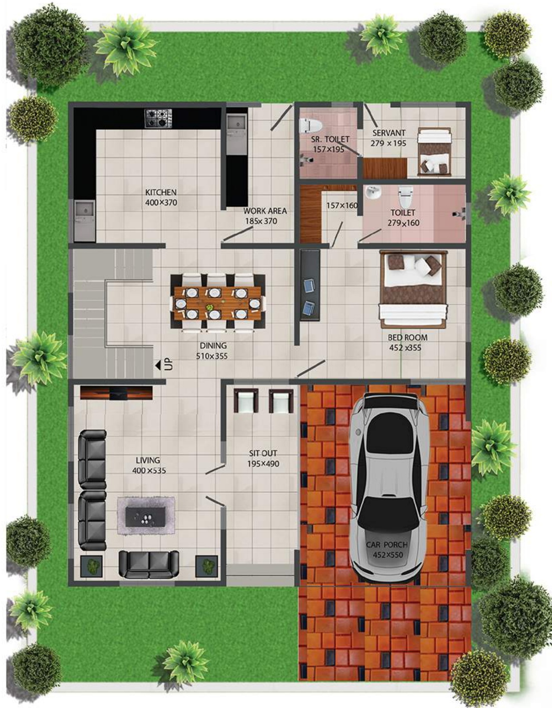
TYPE : C Ground Floor: 1559 sq.ft.

With advanced amenities on offer, from comforts and luxury to green living and a niche lifestyle.