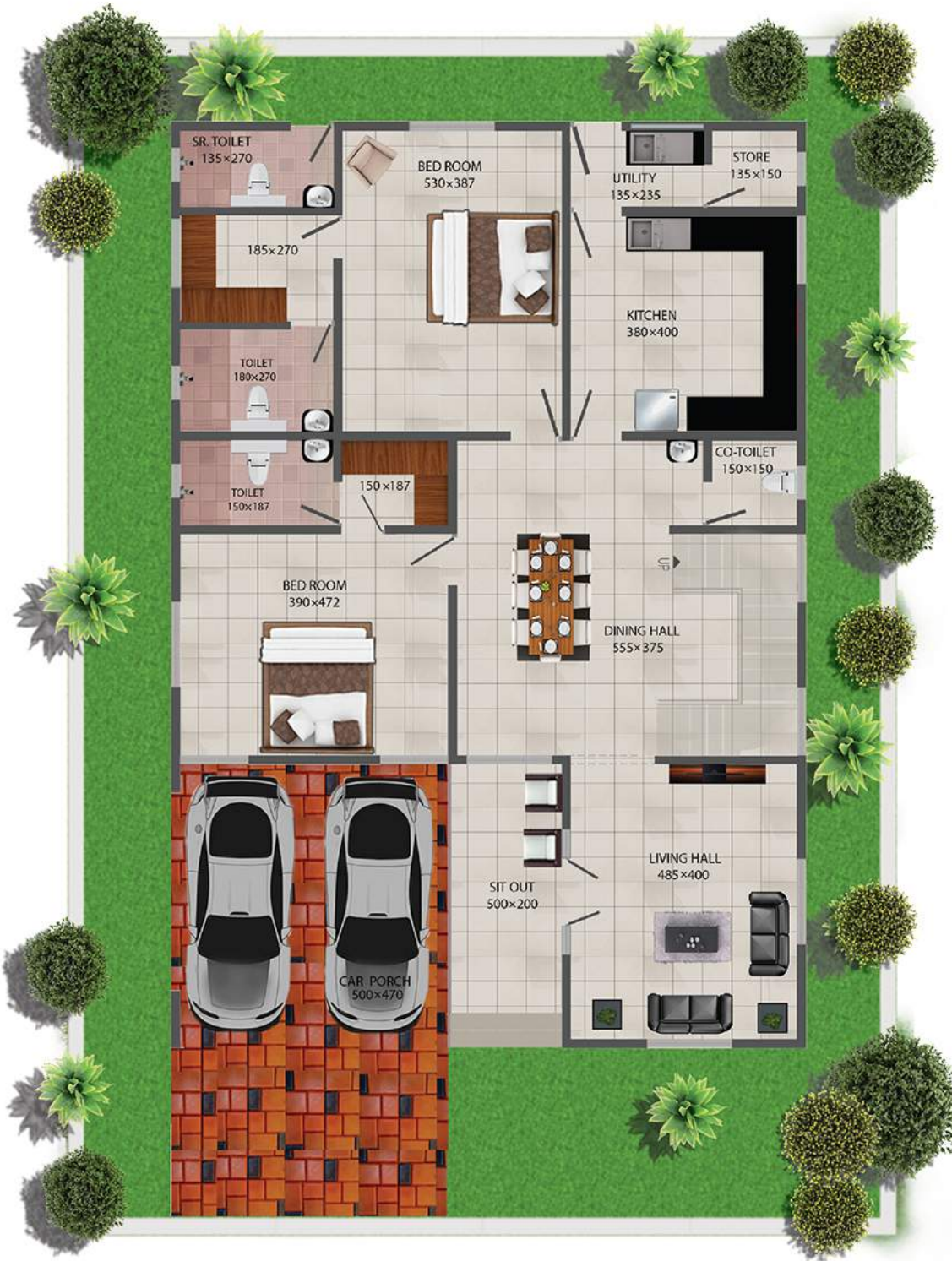
TYPE : D Ground Floor: 1960 sq.ft.

Move up a Fresh perspective and elevate to rejuvenation With Apstone you can share more warmth with your loved ones.