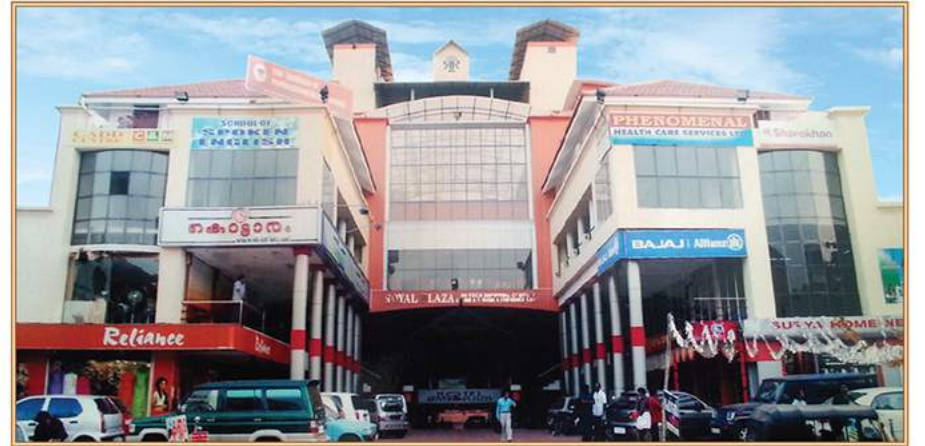
Royal Plaza Perinthalmanna, Malappuram