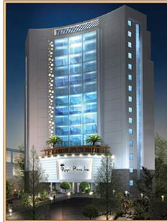
Royal Plaza Inn 5 Star Hotel Calicut, Kozhicode