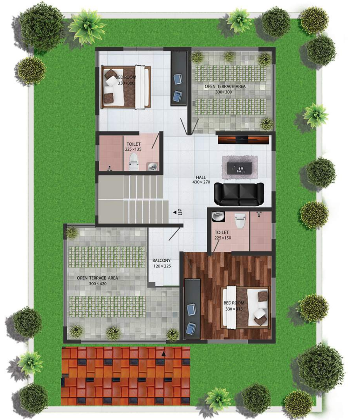
TYPE : A 1st Floor: 581 sq.ft. Total Built-Up Area : 1445 sq.ft.