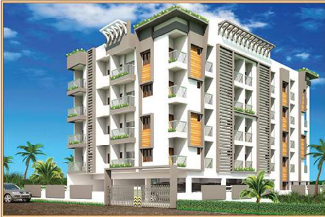
Argento Edappally, Ernakulam