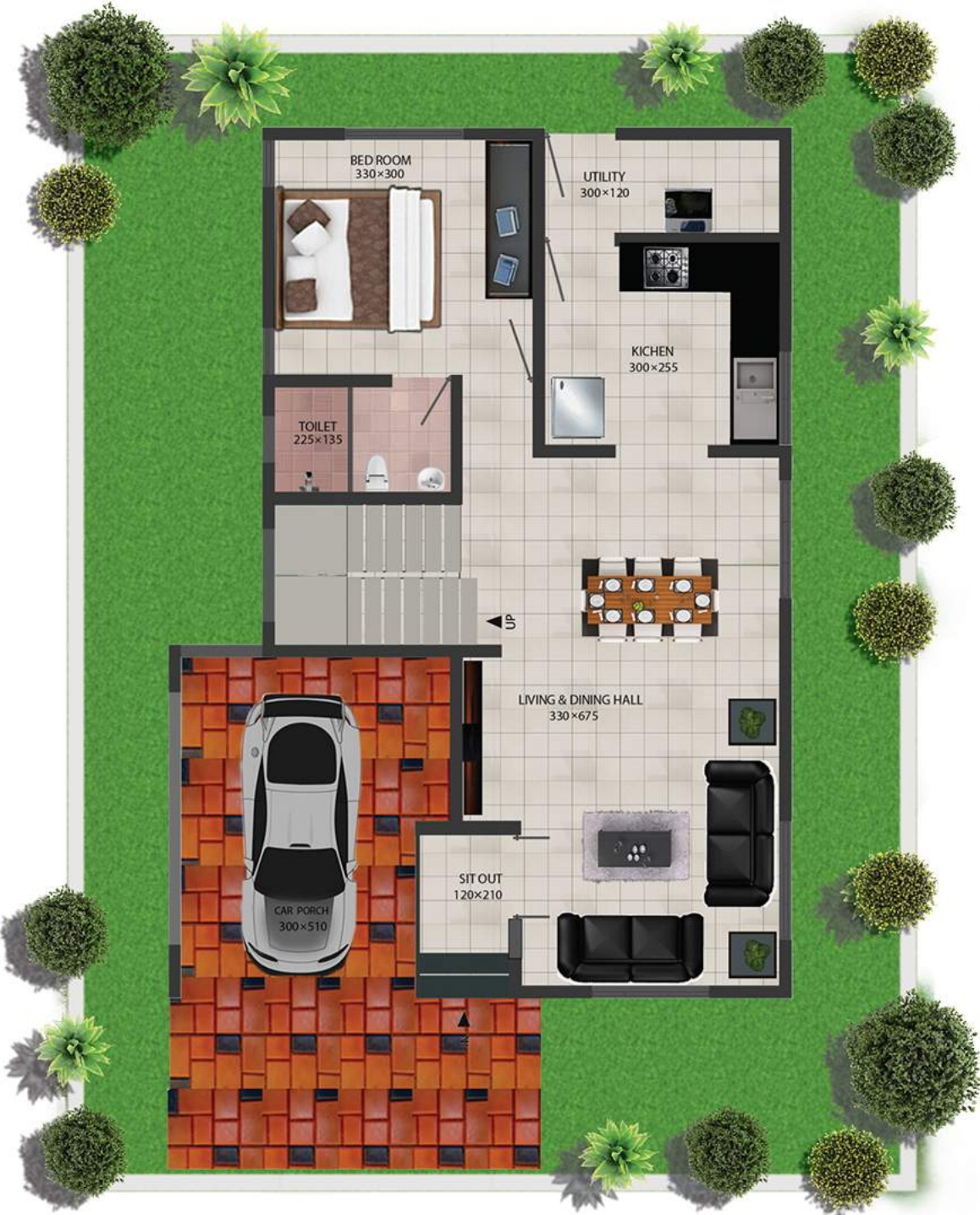
TYPE : A Ground Floor: 864 sq.ft.

Villas and Apartments, built in a serene location, ideal for silent living conditions