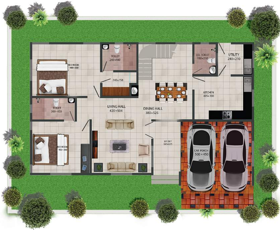
TYPE : B Ground Floor: 1632 sq.ft.

The calm and serene atmosphere with the natural touch of green surroundings that gives you a touch of good memories.