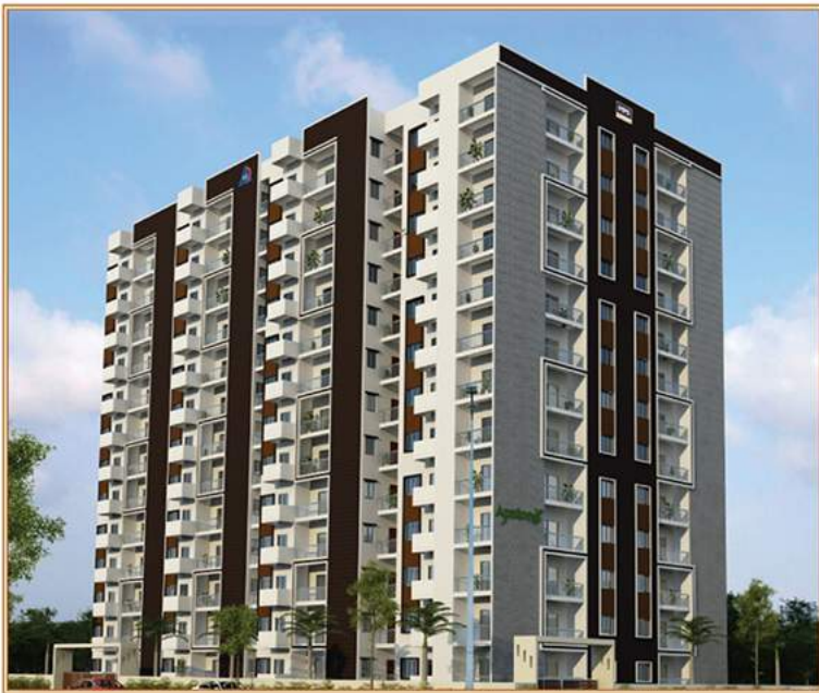
MPS Apstone - Apartments Kazhakoottam, Trivandrum