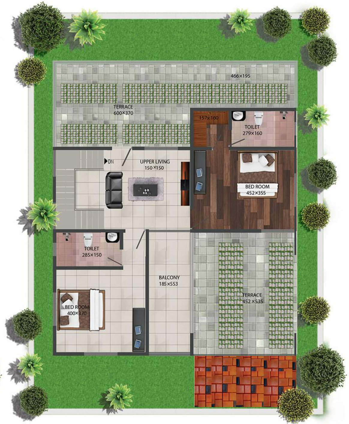
TYPE : C 1st Floor: 918 sq.ft. Total Built-Up Area : 2477sq.ft.