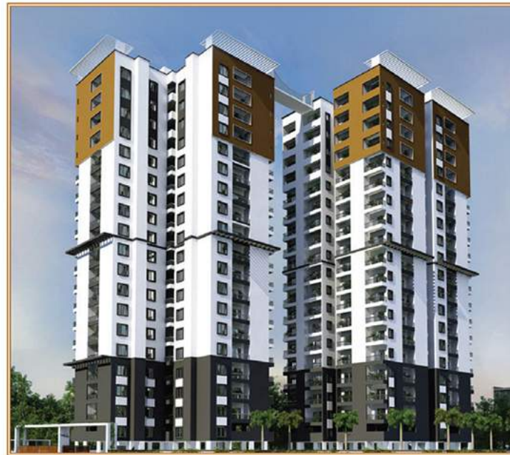
MPS Aambience Thripunithura, Ernakulam