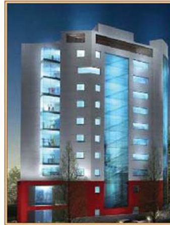
MPS Tower Calicut, Kozhicode