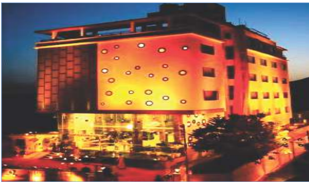
Q Hotel, Fatehpura