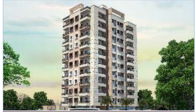
Royal Orchid, Transport Nagar, Udaipur