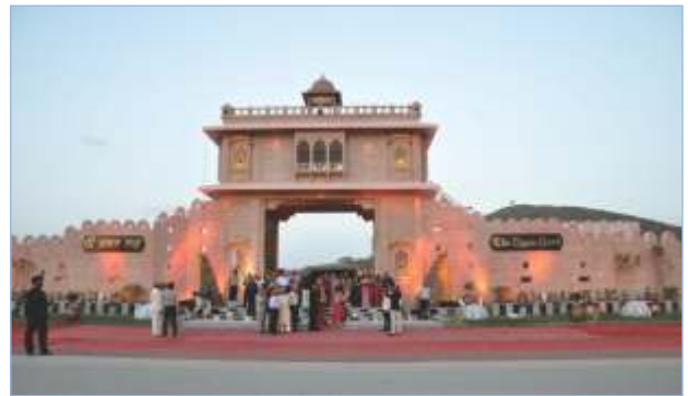
The Gyan Garh, Navratan Complex