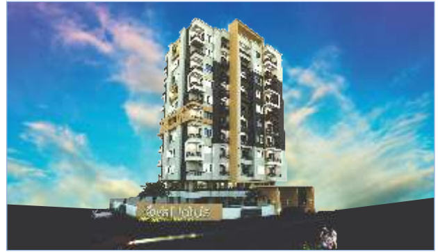
Royal Lotus, Opp. St. Marys School, Titardi