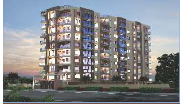
Royal Imperial, Navratan Complex