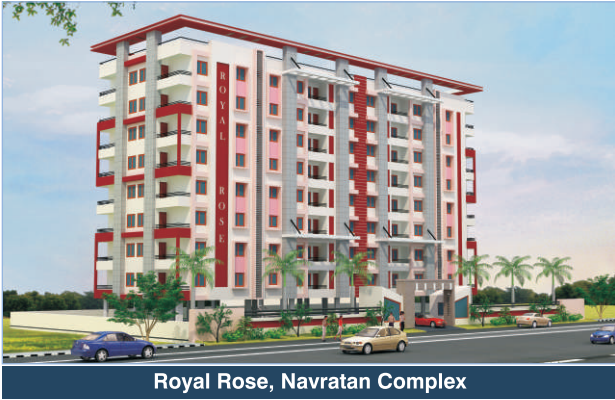
Royal Rose, Navratan Complex