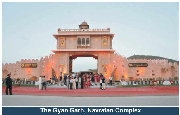
The Gyan Garh, Navratan Complex