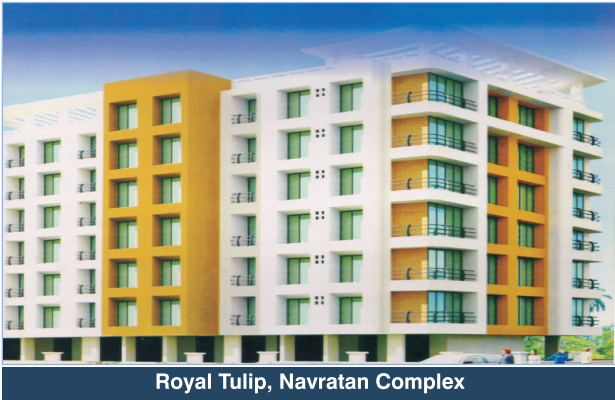
Royal Tulip, Navratan Complex