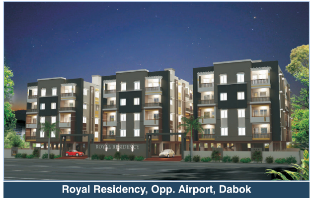
Royal Residency, Opp. Airport, Dabok