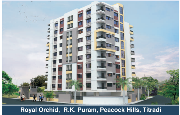
Royal Orchid, R.K. Puram, Peacock Hills, Titradi