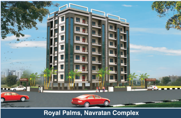
Royal Palms, Navratan Complex