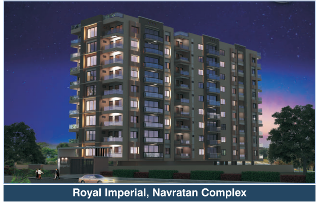
Royal Imperial, Navratan Complex