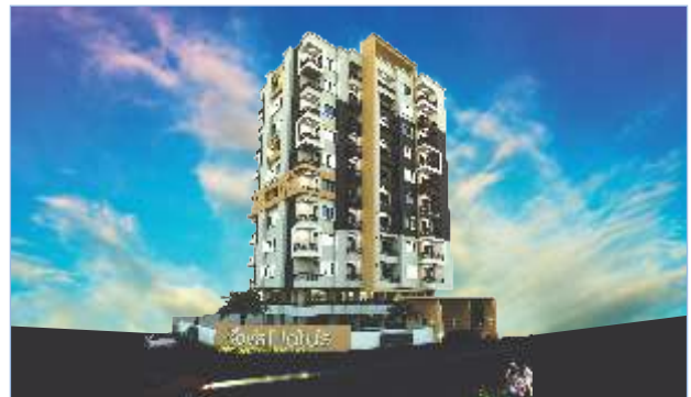
Royal Lotus, Opp. St. Marys School, Titardi