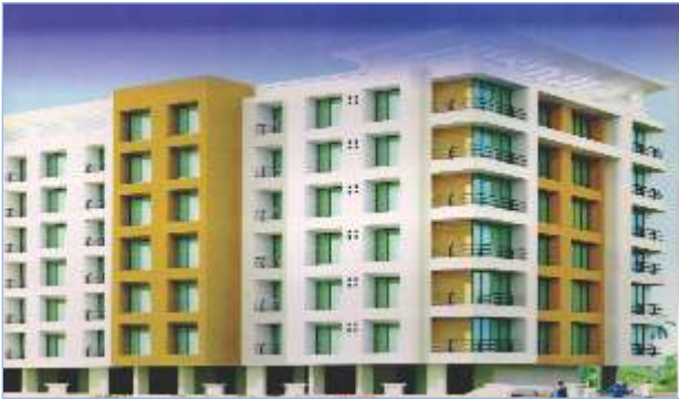
Royal Tulip, Navratan Complex