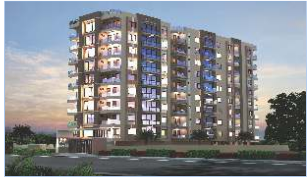
Royal Imperial, Navratan Complex