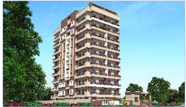
Royal Pine, Sukher, Kota Bawdi