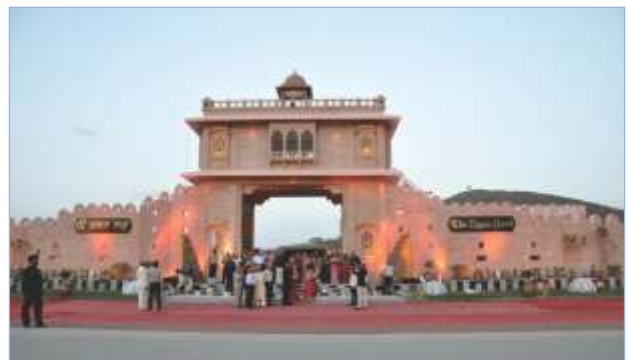
The Gyan Garh, Navratan Complex