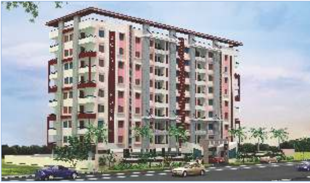
Royal Rose, Navratan Complex