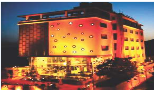
Q Hotel, Fatehpura