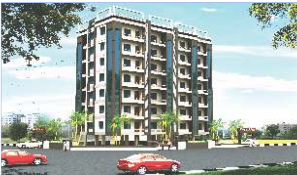
Royal Palms, Navratan Complex