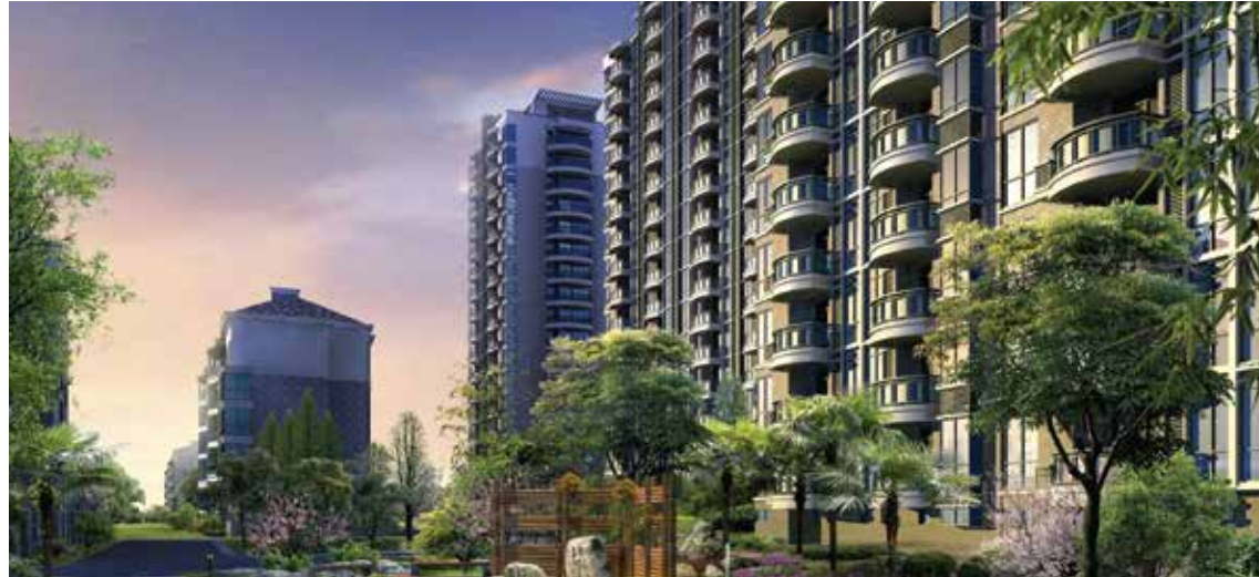
Arun Vintage Hebbal, Bangalore.