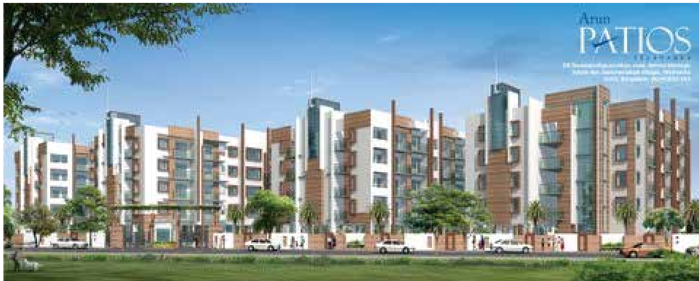
Arun Patios, 248 UNITS