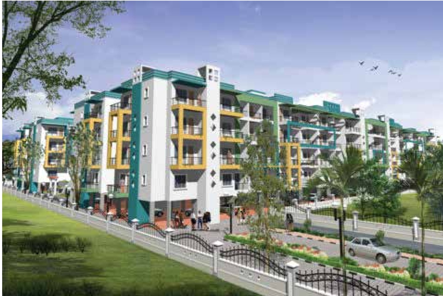
M.S. Palazzo, 120 UNITS