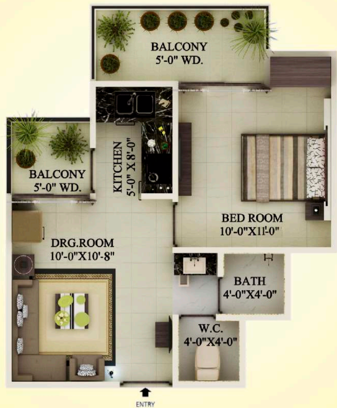
FLOORPLAN One Bedroom Super Area 550 sq. ft.