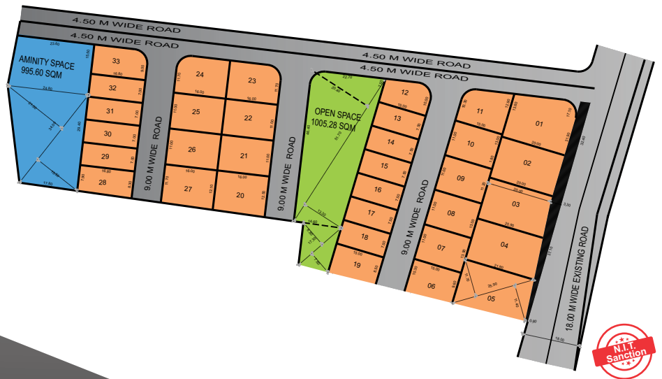
LAY OUT PLAN SCALE 1:500