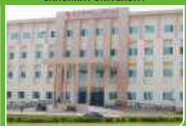
K.D. MEDICAL INSTITUTE/HOSPITAL