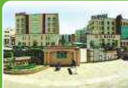
G.L. BAJAJ INSTITUTE

OM PROPTech PVT. LTD. An ISO 9001 : 2008 Certified Company