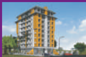
Premier Heights, Manipal