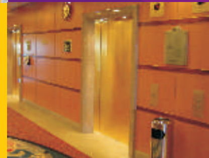
10 passenger automatic lift