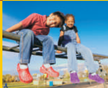
Children play area