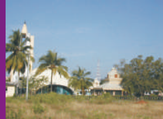
Shri Venu Gopalakrishna Temple

Manipal has undergone an astounding metamorphosis; from a rocky hillock a little away from the temple town of Udipi to a world class education and healthcare centre with modern educational institutions, IT parks, outstanding business achievements and success stories. The new cosmopolitan culture that Manipal espouses reflects its global stature. A city that celebrates life.