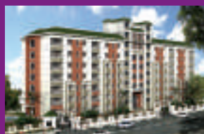
Premier Green Woods, Manipal