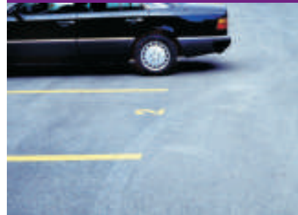
Ample parking space