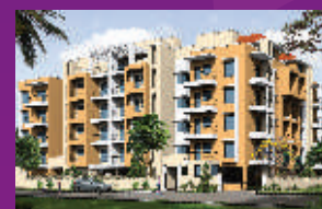
Premier Solitude Nagavara, Bangalore North