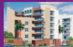
Premier Residency Richards Town, Bangalore