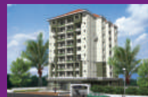
Premier Enclave, Manipal