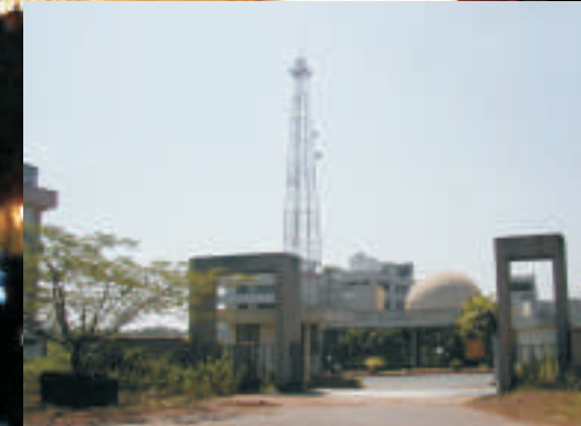
Dr. TMA Pai Planetarium