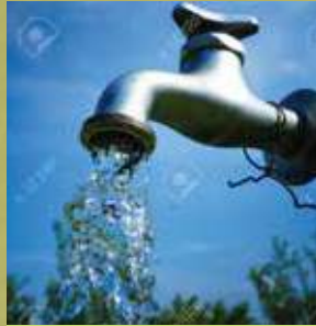
Water Supply with Overhead Tank