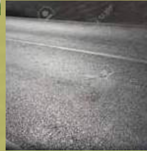
Tar Roads with Avenue Plantation