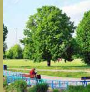
Large Park with Trees