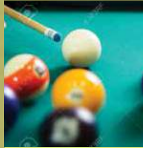
Amenity Center with Club Facilities