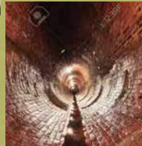
Underground Drainage System