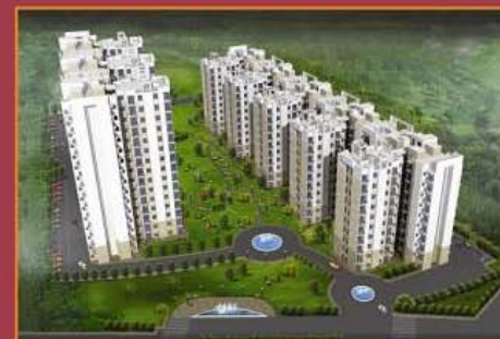
Perspective View of Avalon Rangoli, Bhiwadi