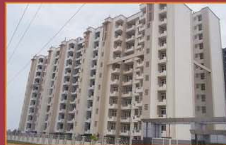
Actual Site Photograph of Avalon Gardens, Bhiwadi