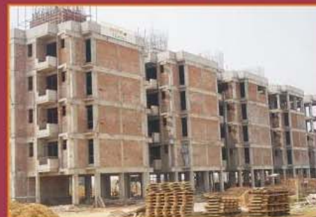
Actual Site Photograph of Avalon Homes, Bhiwadi