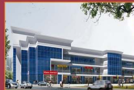
Perspective View of Avalon Plaza, Bhiwadi