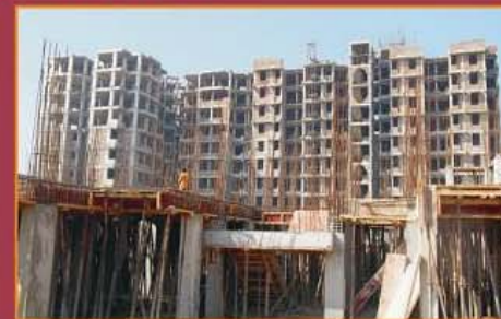
Actual Site Photograph of Avalon Residency, Bhiwadi