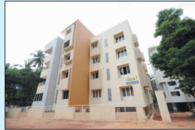
Providence Abode - 1 Bejai New Road, Mangalore