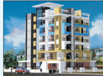
Providence Abode - 2 Bejai New Road, Mangalore