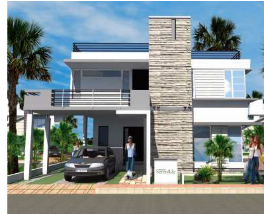
Just two of the many villa designs you can choose from for your dream home.