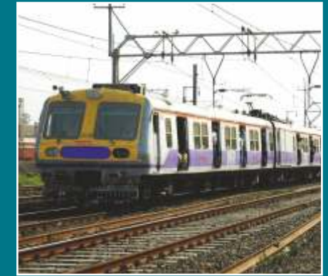
Panvel Railway Station