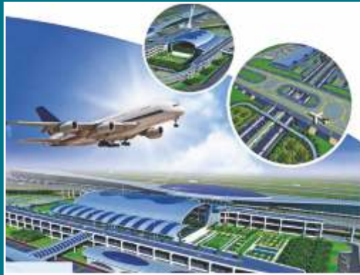
Navi Mumbai Inter. Airport