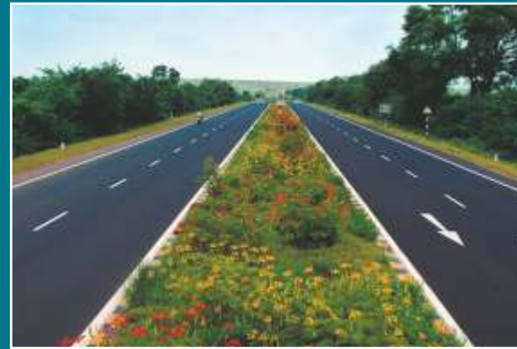
Mumbai-Pune Express Highway