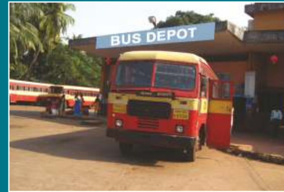
Panvel Bus Depot