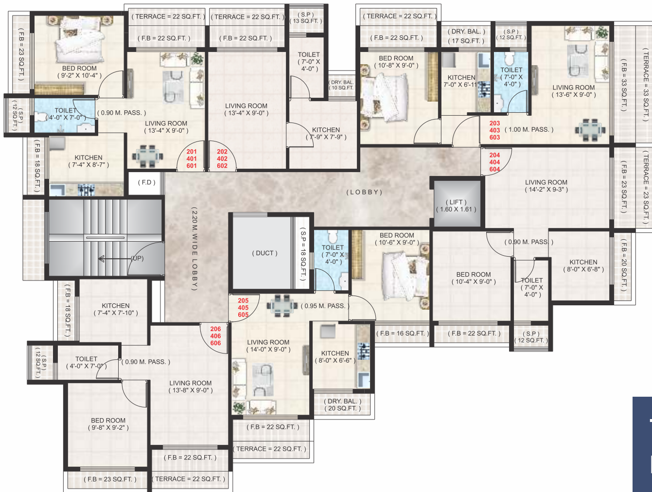
TYPICAL FLOOR PLAN (2ND, 4TH & 6TH)