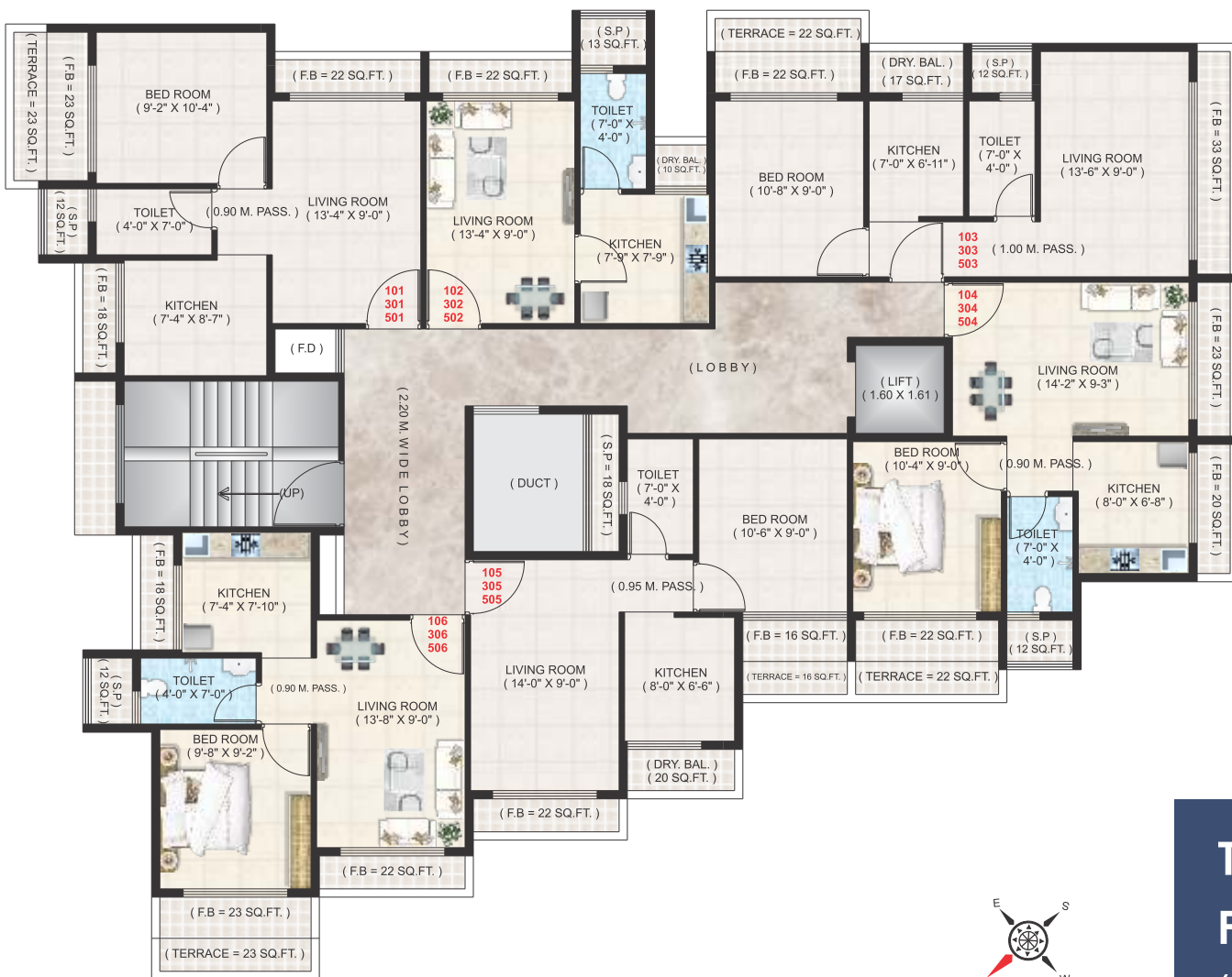
TYPICAL FLOOR PLAN (1ST, 3RD & 5TH)