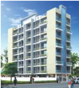
Plot No. 177, Sector - 30, Kharghar, Navi Mumbai.