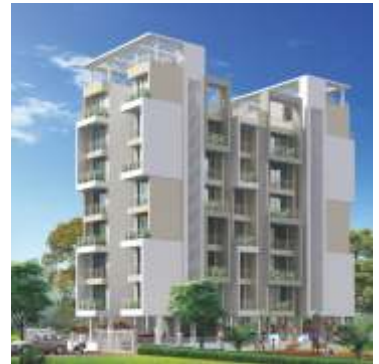
Plot No. 267, Sector - 17, Ulwe, Navi Mumbai.