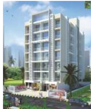
Plot No. 154, Sector - 19, Ulwe, Navi Mumbai.