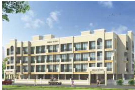
Gut. No. 109 /0, At - Vichumbe, Panvel, Navi Mumbai.