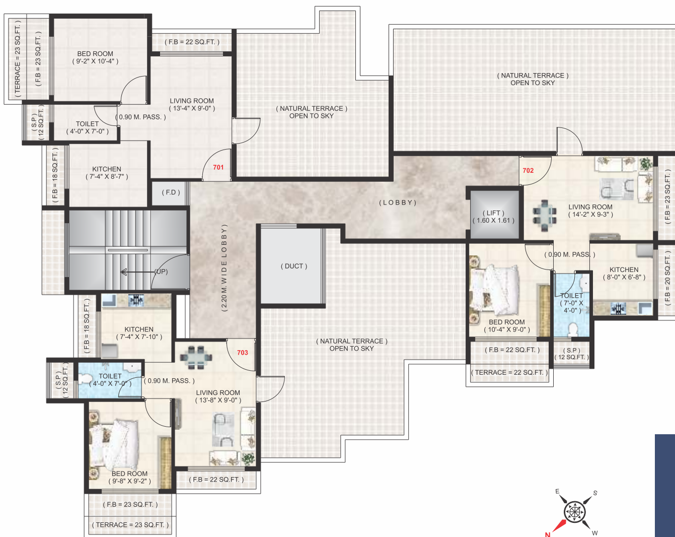
SEVENTH FLOOR PLAN