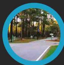
9METER TAR ROADS