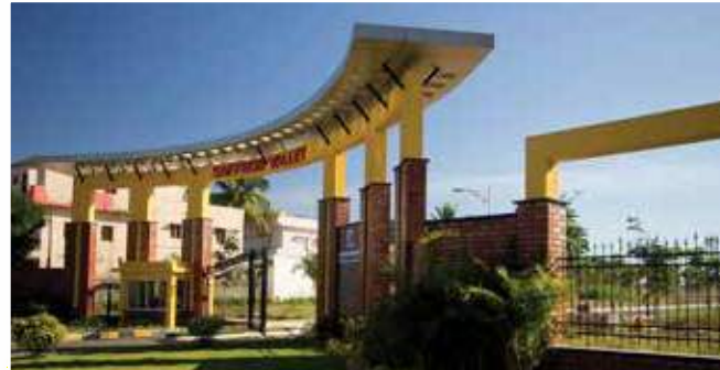
Saffron Valley, Devanahalli