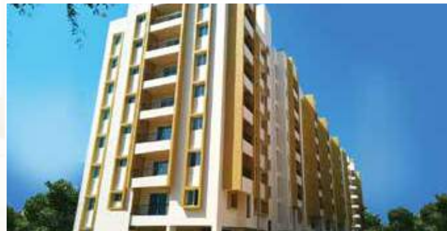
Sumo Leaves Kanakapura Main Road, Bangalore