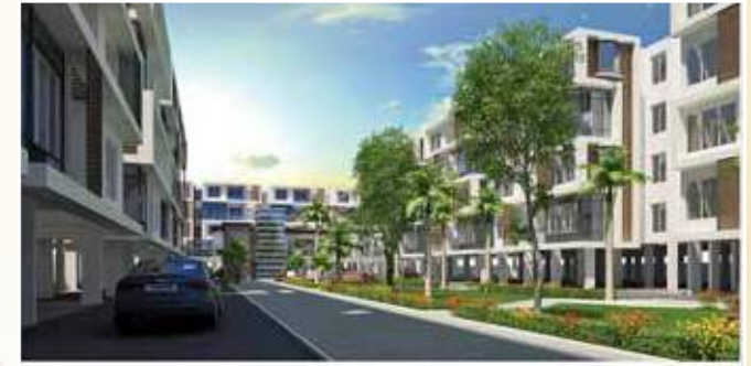
Lilium Gardenia, Hegde Nagar, Bangalore