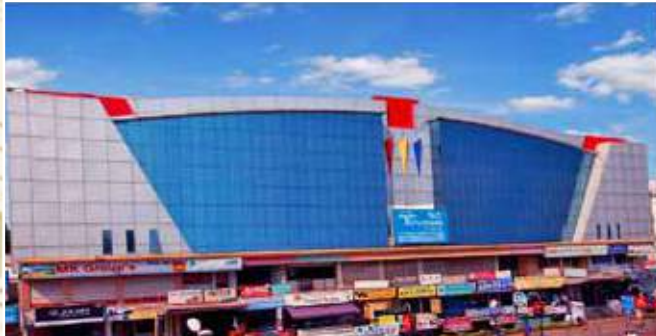
Dhammanagi Prestige Plaza, Hubli