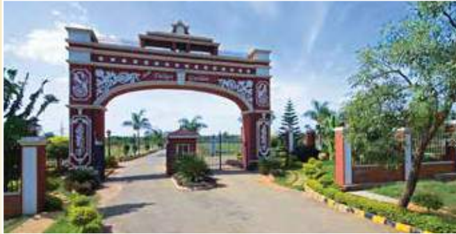
Tulips Garden, Behind ITC Factory International Airport Road, Bangalore