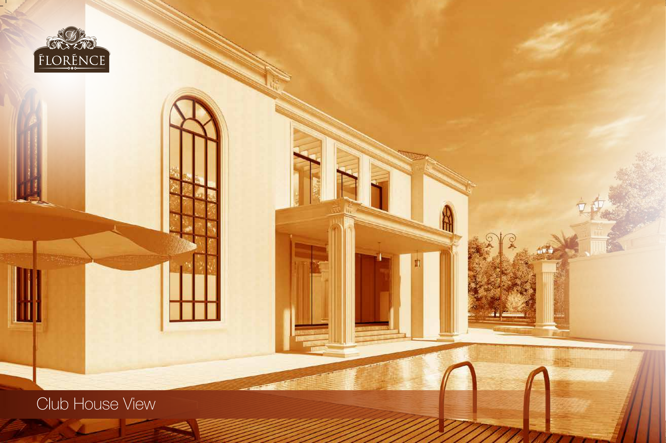
Club House View