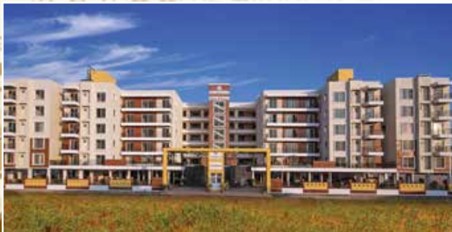
Gladiola Gardenia Hegde Nagar, Bangalore