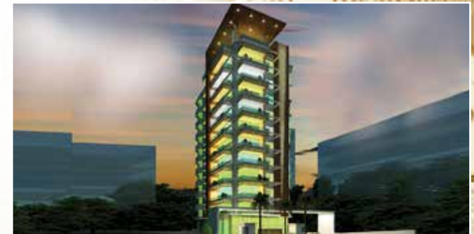
Zeus, Cunningham Road, Bangalore