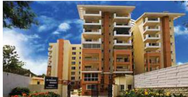
Sri Rudraksh Residency Bannerghatta Road, Bangalore