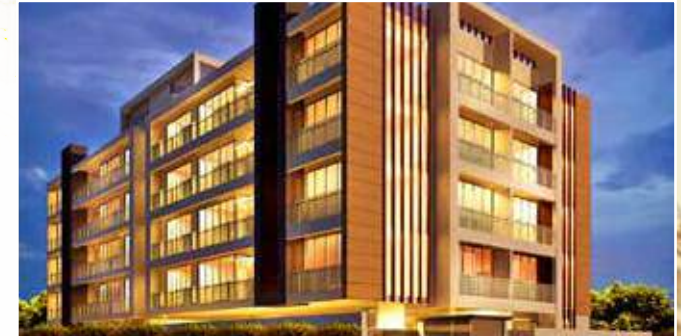
Garden Terraces, Chamarajpet, Bangalore