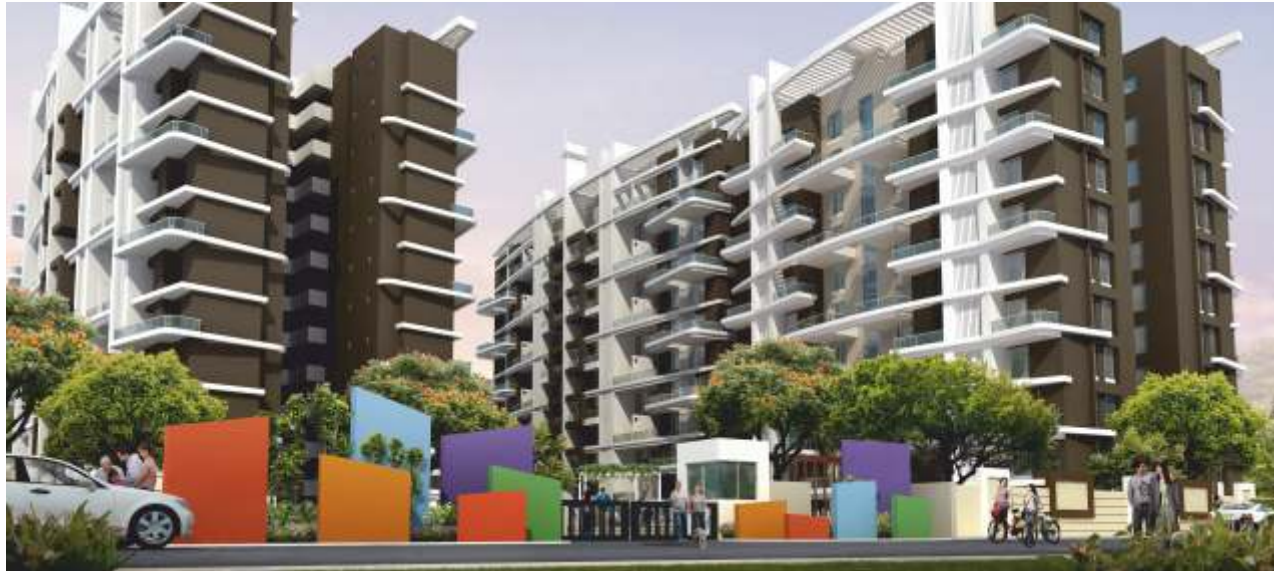
TIRUPATI KASHIGANGA @ DHANORI