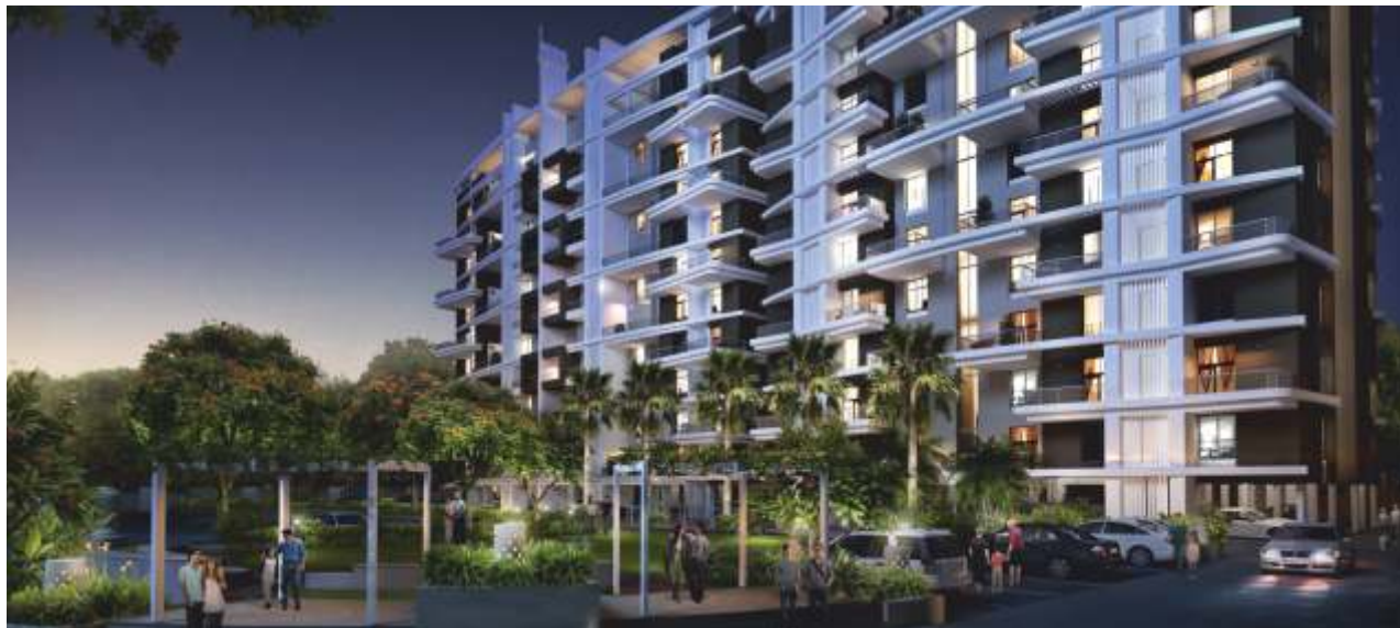
TIRUPATI VASANTAM @ DHANORI