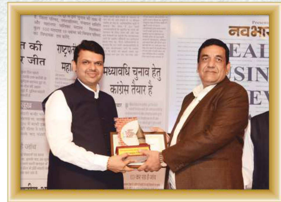
Roongta Group Awarded for "Affordable Homes with Best Amenities" from Hon. C. M. Shri Devendraji Fadnavis on 24th Oct. 2016.