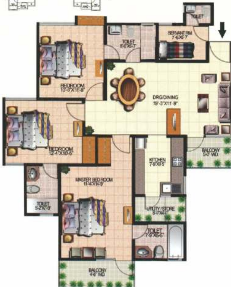
3 Bed + Servant + 3 Toilet