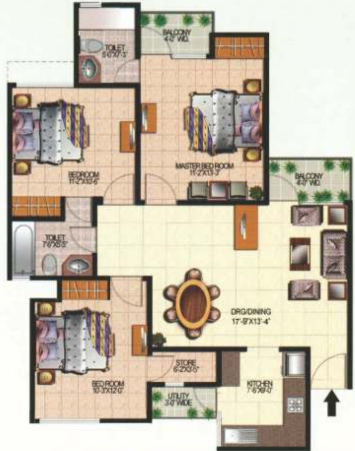
3 BED + STORE + 2 TOILET