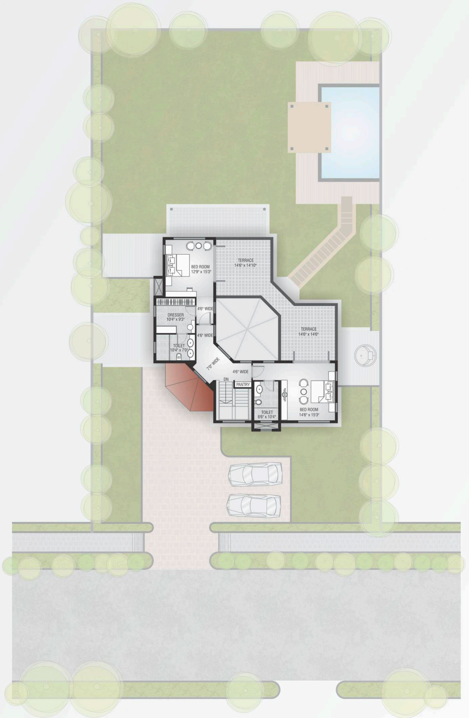
OPTION-4 FIRST FLOOR