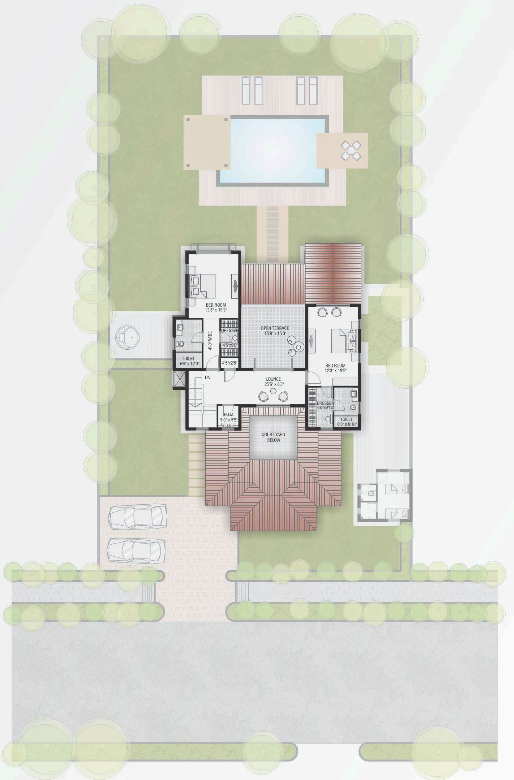
OPTION-5 FIRST FLOOR