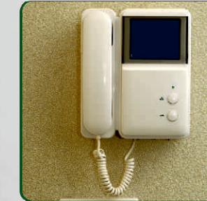
Video door phone system & intercom system