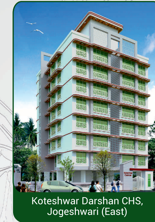
Koteswar Darshan CHS, Jogeshwari (East)