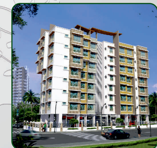
Sweta CHS, Jogeshwari (East)