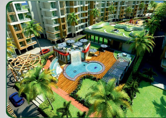
Dipti Sky City, Ambernath (East)