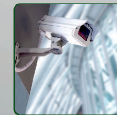
Digital Surveillance System with CCTV