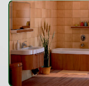
Designer wall tiles in bathroom with anti-skid flooring