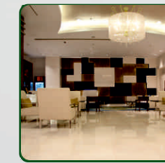
Decorative Entrance Lobby

Attractive main gate with security cabin