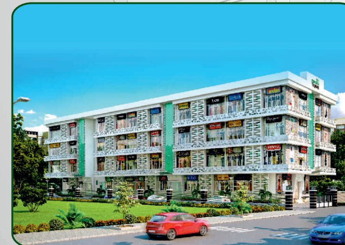
Dipti Square, Jogeshwari (East)