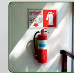
Fire fighting system