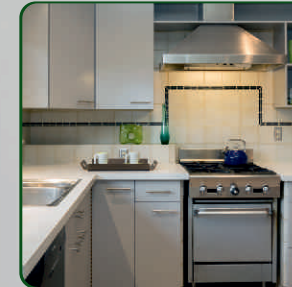
Modular Kitchen with 4-burner Hob and Chimney