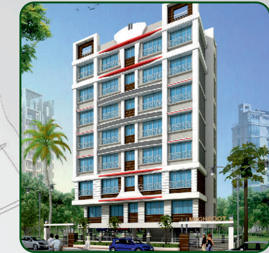
Meghdoot CHS, Vile Parle (East)