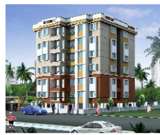
MATHA Residency N.H-66, Kaup