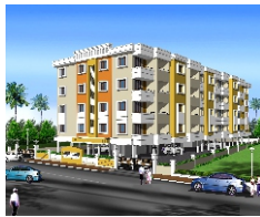
KATEEL Residency MUKKA