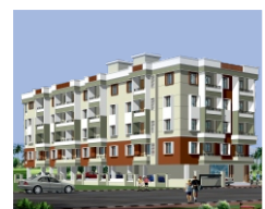
MOOKAMBIKA Residency Near Railway Station Surathkal, Mangalore