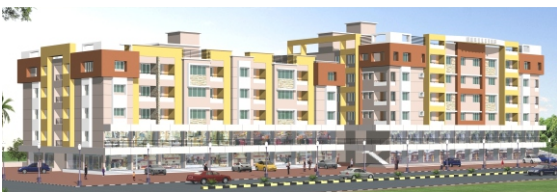
MATHA Residency N.H-66, Near Mulky Railway Station, Haleyangadi, Mangalore