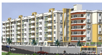
MATHA Residency Opp. Mount Carmel Central School, International Airport Road, Maryhill, Mangalore