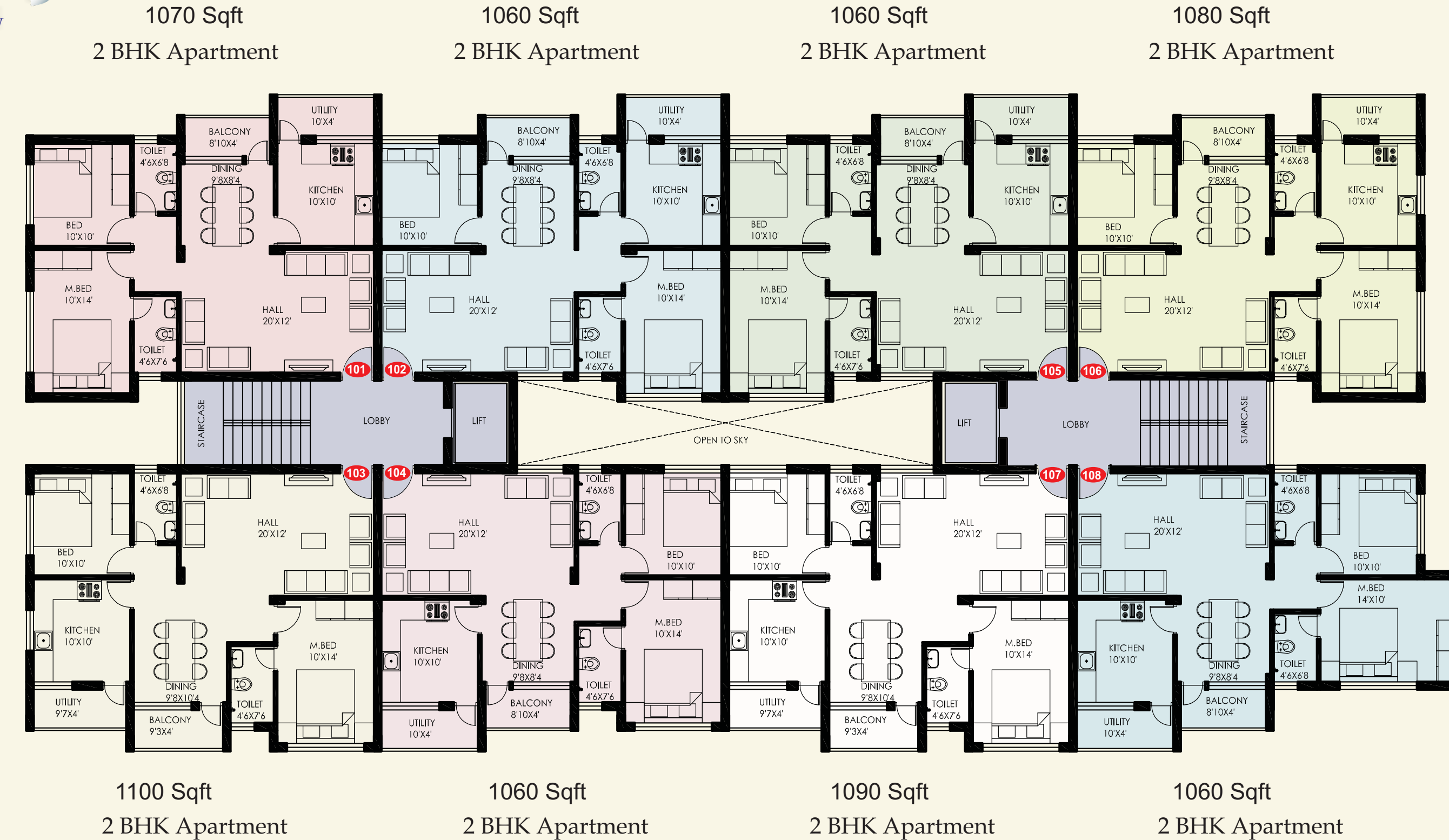
2 BHK Apartment