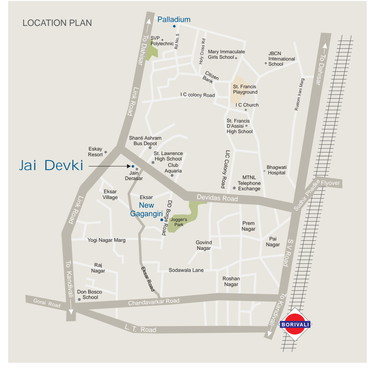
Site : Jai Devki "A" CHS Ltd., Devki Nagar, Near Shanti Ashram, Borivali (West), Mumbai - 400 103.