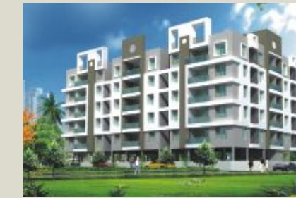
▲ MK MEADOWS, TARAKARAMA, RUSHIKONDA