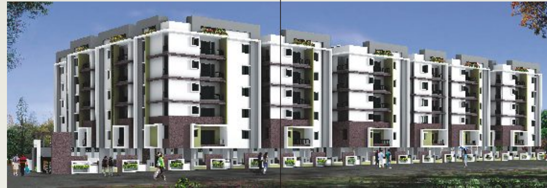
▲ MK SENATE, MADHURAWADA