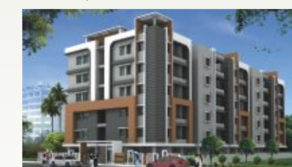
▲ MK PRESTIGE, PM PALEM