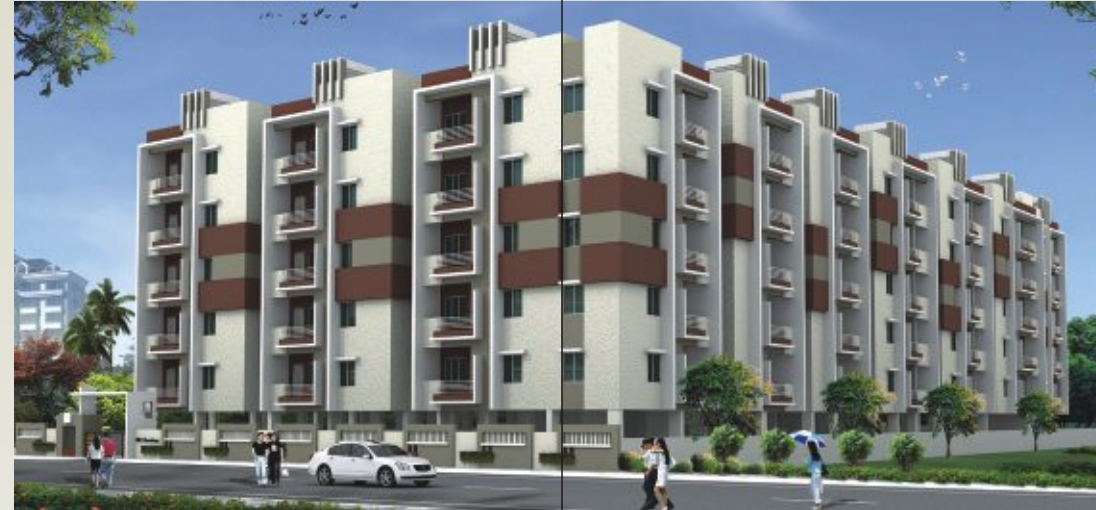
▲ MK RESIDENCY, PM PALEM