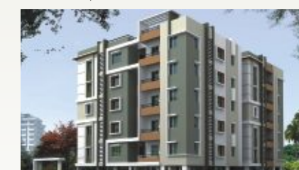
▲ MK ORCHIDZ, PM PALEM