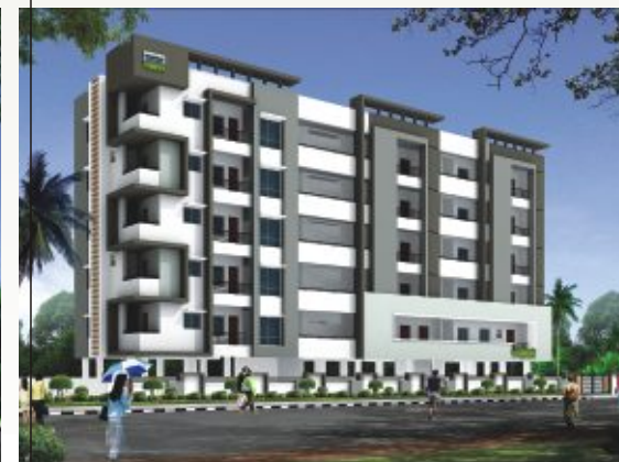
▲ MK VENUS, PM PALEM