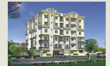
▲ MK VIHAR, MADHURAWADA