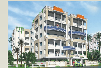
▲ MK ROYAL, MAHARANIPET