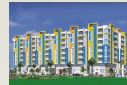
▲ MVV & MK ROYAL GARDENS, RAM NAGAR