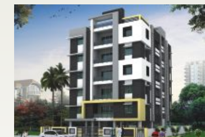
▲ MK MARVEL, KIRLAMPUDI LAYOUT