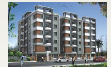
▲ MK VISTA, MADHURAWADA