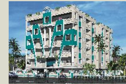
▲ MK PARADISE, B S LAYOUT, SEETAMADHARA