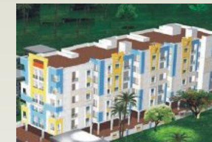
▲ MK SUNRISE, PM PALEM