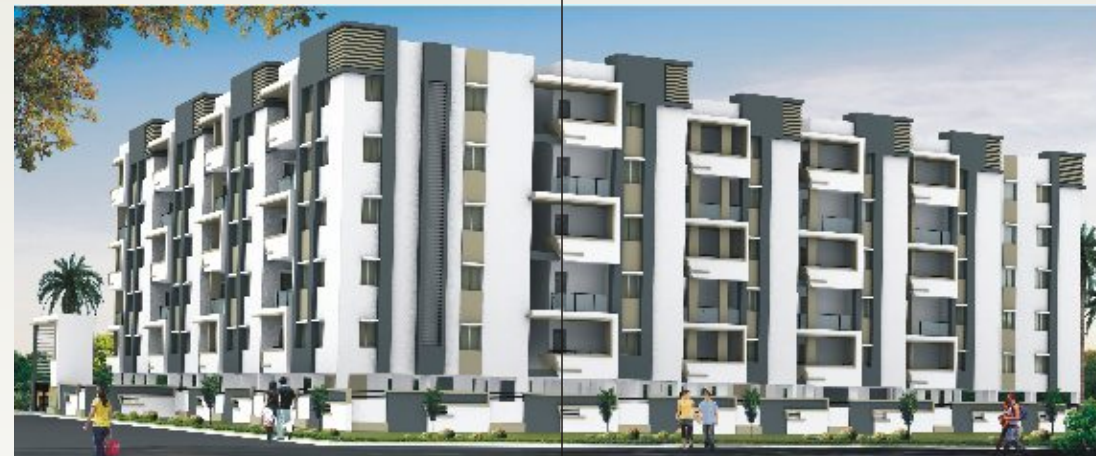
▲ MK ARENA, YENDADA