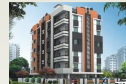
▲ MK VILLA, PM PALEM