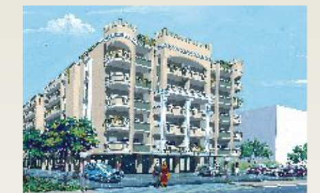
▲ MK TOWER, B S LAYOUT, SEETAMADHARA