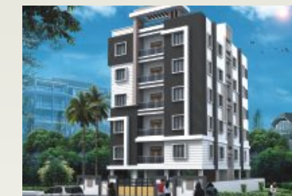
▲ MK WOODS, EAST COLONY