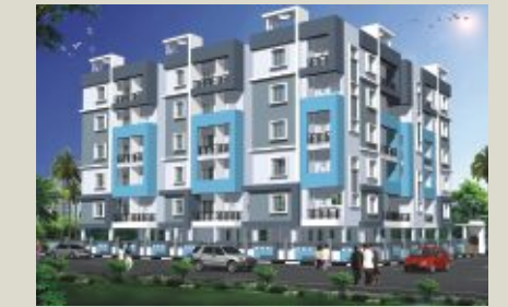
▲ MK HOMES, PM PALEM