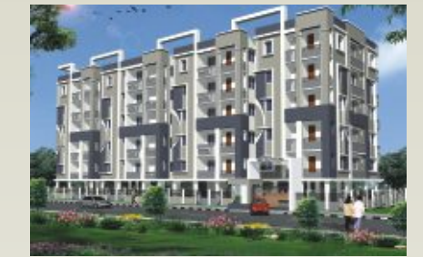
▲ MK SAPPHIRE, PM PALEM