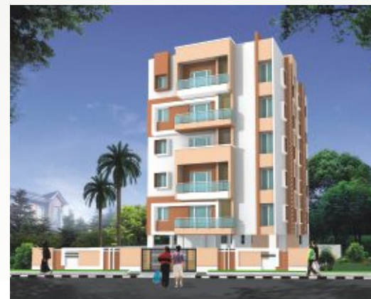
▲ MK LOTUS, PM PALEM