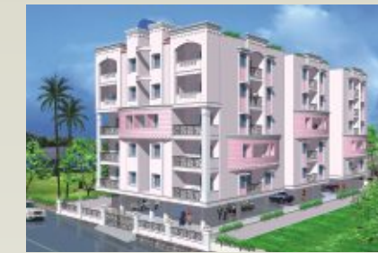
▲ MK MANOR, RAMNAGAR