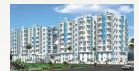
▲ MK SIGNATURE, RAJAHMUNDRY