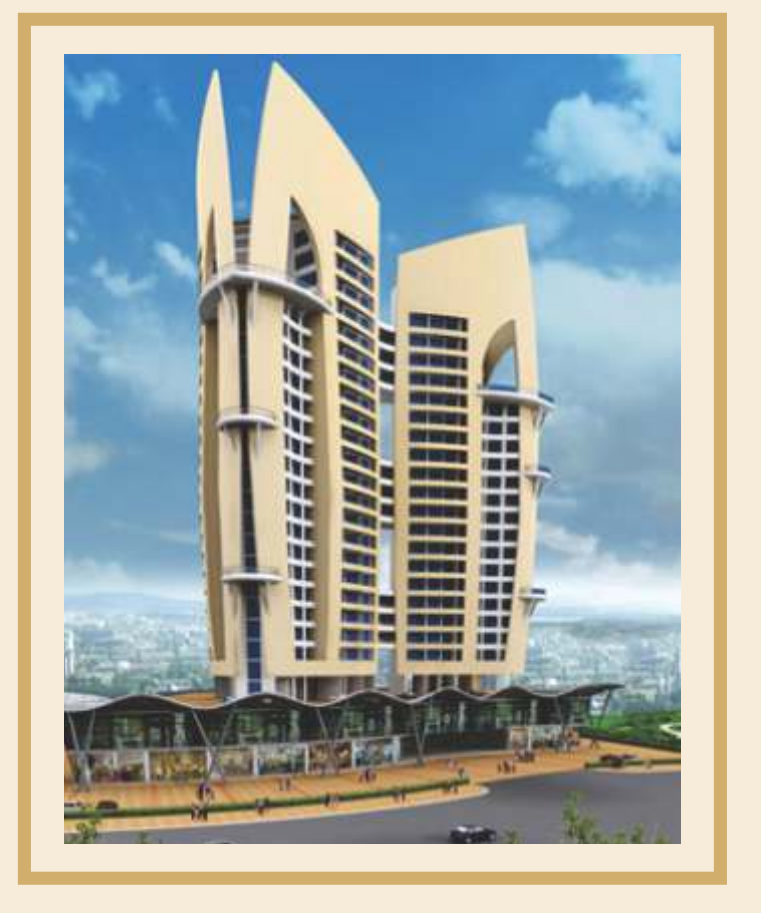
NAVJEEVAN C.H.S. - Malad (E)