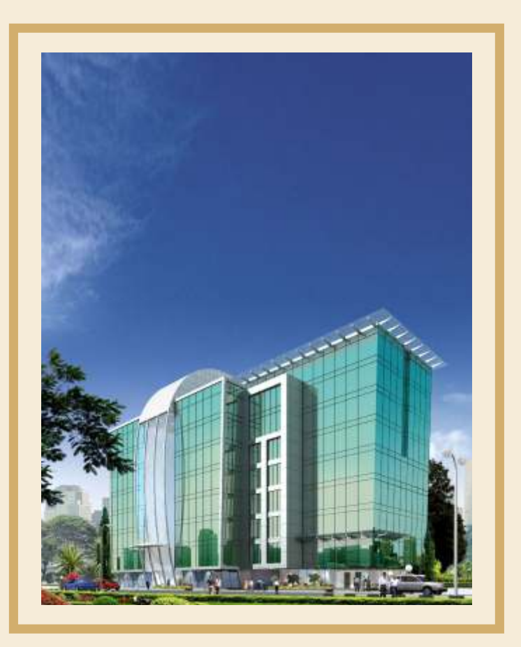
MAHESH EXCELLENCY - Andheri (E)