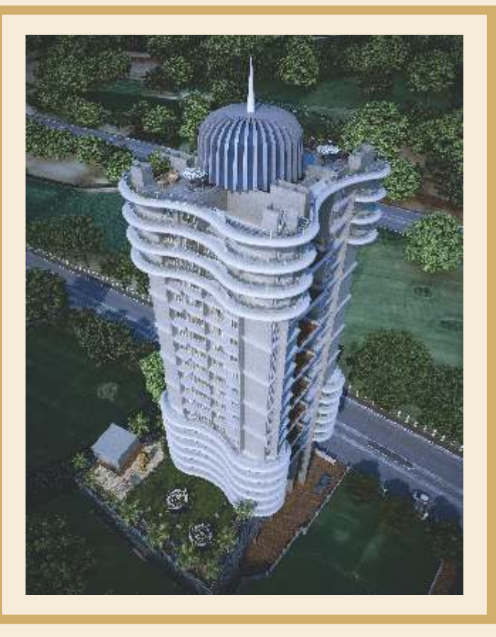
VRINDAVAN - Borivali (E)