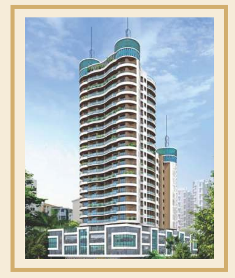
GRISHMA HEIGHTS - M.G. ROAD, Kandivali (W)