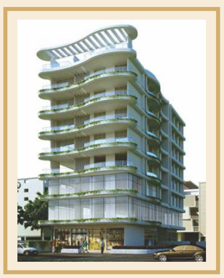
SUPRIYA HEIGHTS - Mulund (W)