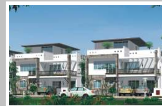
KEERTHI RICHMOND VILLAS Hyderguda