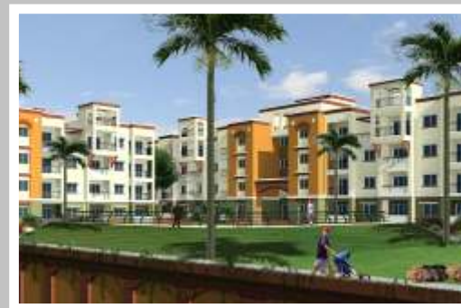
KEERTHI HARMONY Ramamurthy Nagar