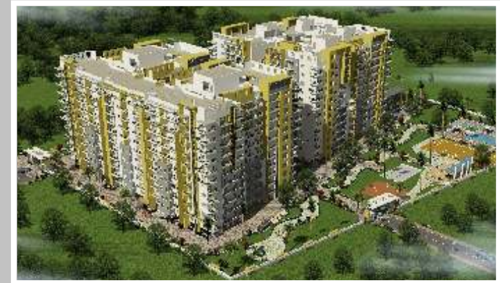
KEERTHI Gardenia Marathahalli, Whitefield