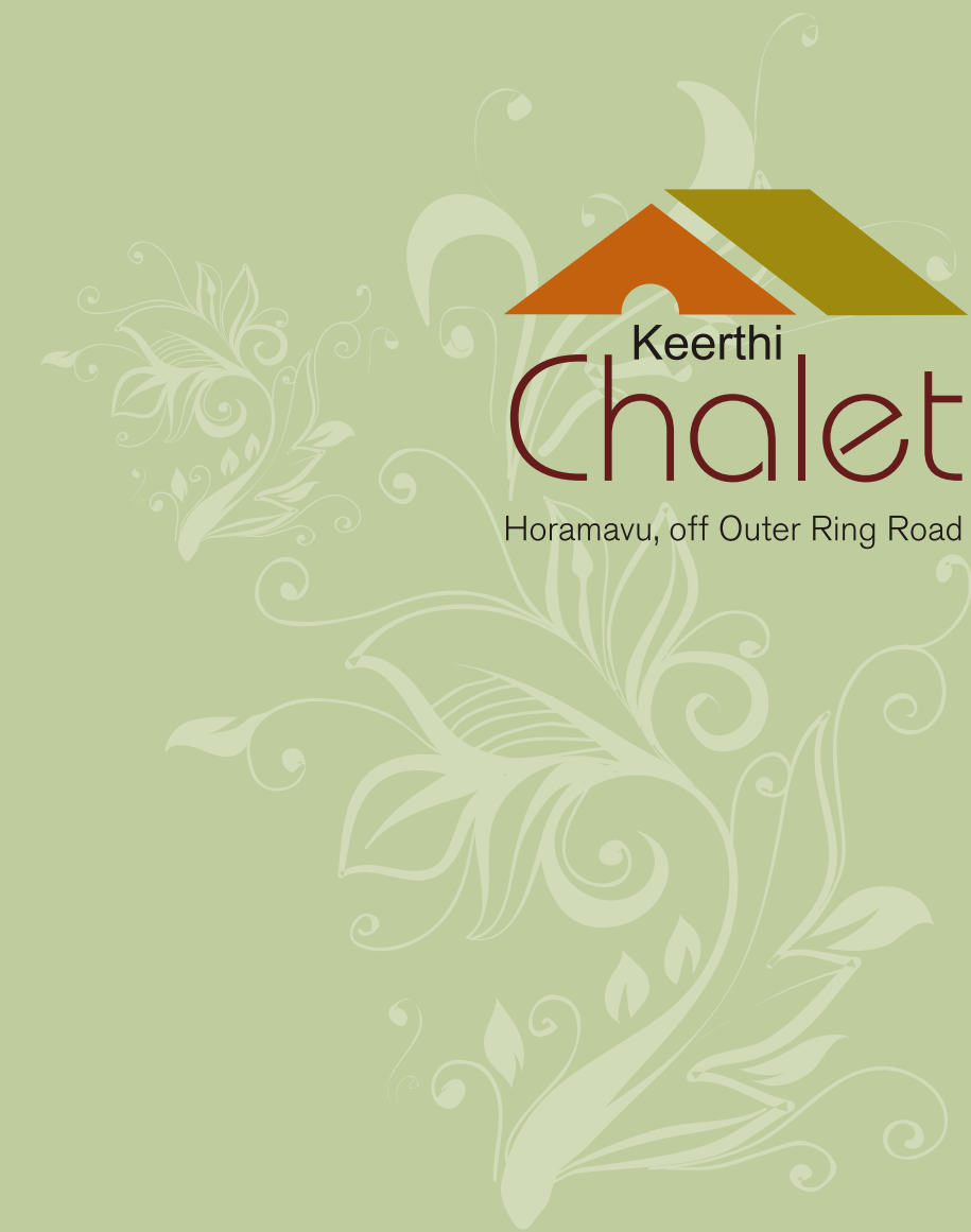
Image of that perfect home that you always have desired is here to welcome you.

Located in the rapidly growing residential hub of North East Bangalore, Keerthi Chalet takes you out of the closet and brings you in a soulfully delighted atmosphere.