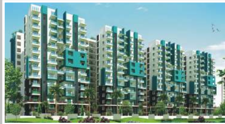
KEERTHI Royal Palms Hosur road, next to BMW showroom