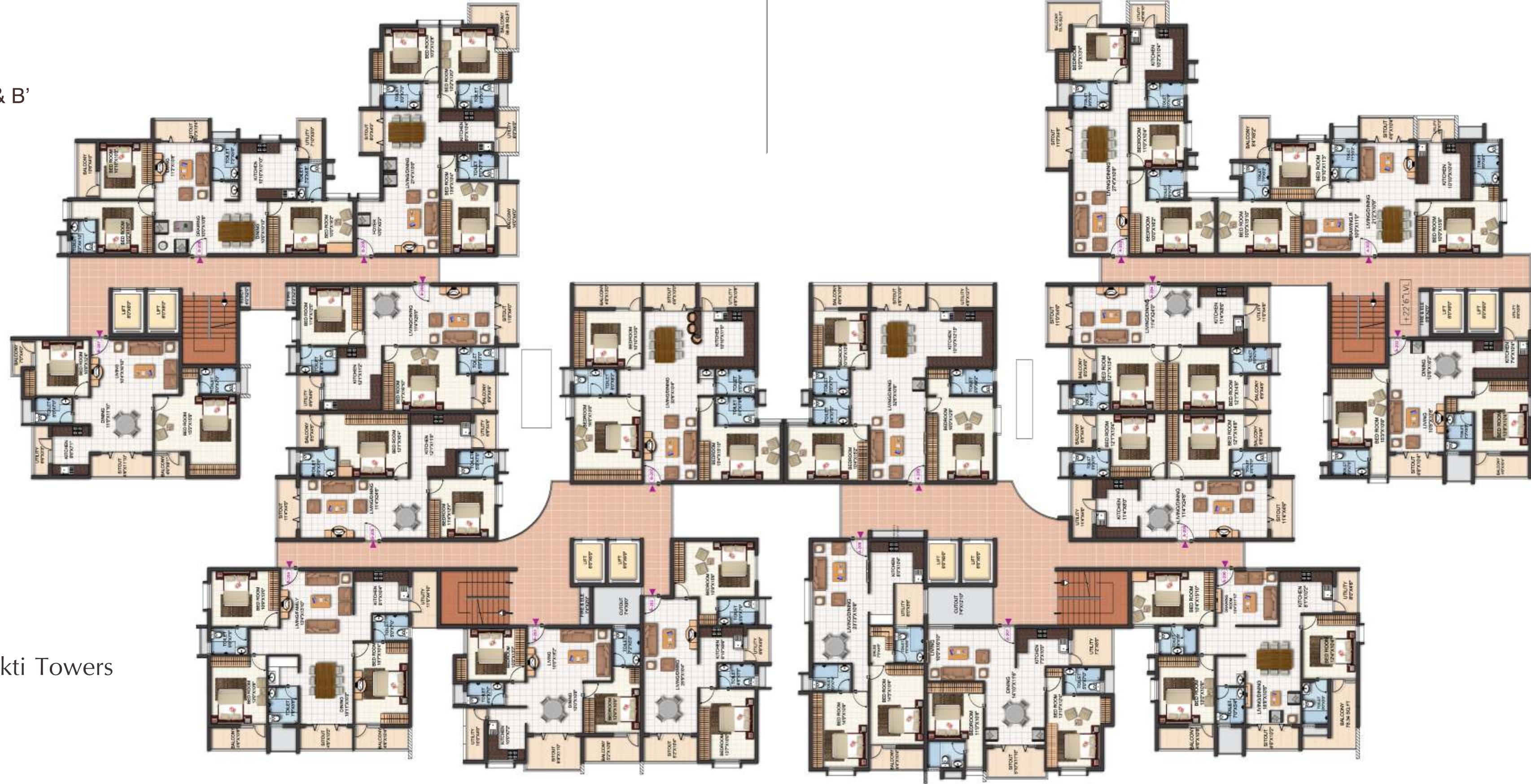
Typical floor Plan - Bock 'A & B'