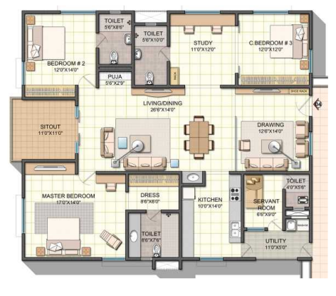
1875 Sft, 3 BHK + SQ, WEST FACING

2540 Sft, 3 BHK + STUDY + SQ, EAST FACING