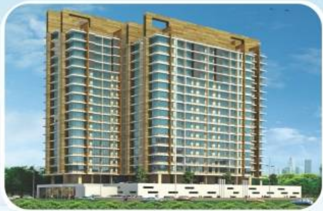
Aims K. Horizon - Bhandup (Mumbai)