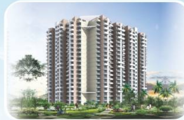
AIMS M.G. Resi. Complex-I, Plot No 7 - Sector 75 (Noida)