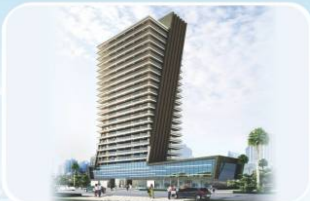
Aims K. Siddhant - Versova (Mumbai)