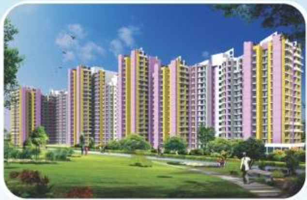
AIMS M.G. Resi. Complex-III, Plot No 11 - Sector 75 (Noida)