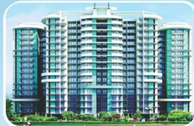
Aims R.A. Golf Avenue - II, Sector 75 (Noida)