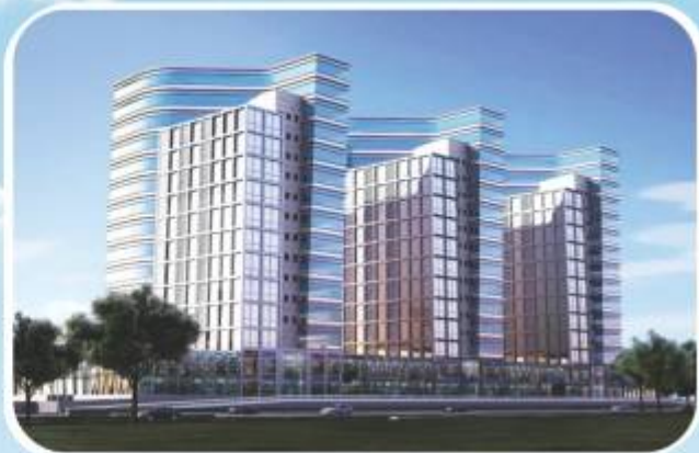
Aims Noida Business Park - Sector 75 (Noida)