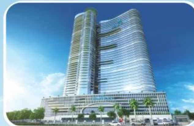
Aims S. The Tempean - Sector 15 (Noida)