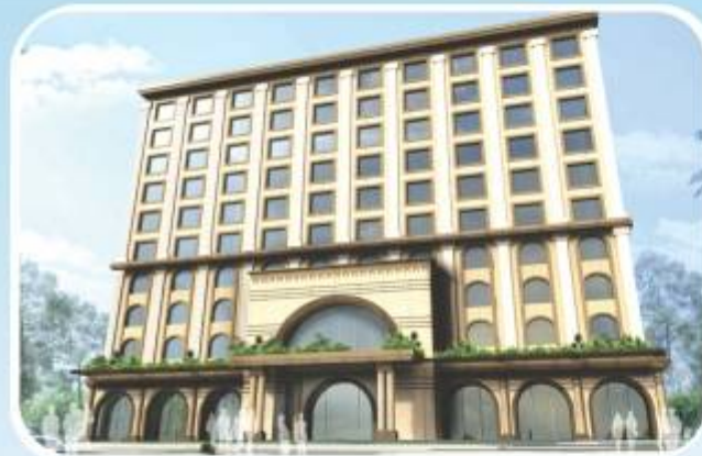
Aims Suites - Heston (London)

Setting new standards in the real estate industry, Aims Group has earned a stellar reputation for its dedication to the development of superior quality properties distinguished by sophisticated design, gracious floor plans & first class amenities. Led by the belief that the places in which we live, work and play have an important influence in nurturing progress and success, Aims Group is committed to constantly innovating and creating effective spaces that will improve and inspire better lives. Leveraging on proven track record, strong expertise, reputation and financial strength, we are contributing significantly to the cityscape of Indian Cities. The Company's developments always seek to fit harmoniously into their environments and enhance the values of the sites. With efficient space planning, top-grade finishes and creative solutions, we have been setting new benchmarks of a premium lifestyle with every new development.