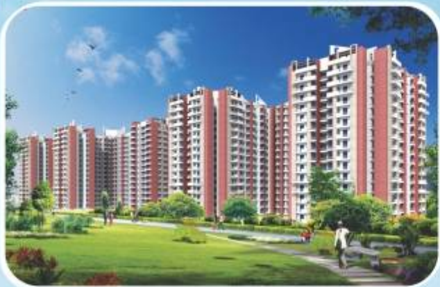
AIMS M.G. Resi. Complex-II, Plot No 8 - Sector 75 (Noida)