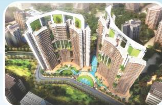
Aims K. Everglade - Thane (Mumbai)