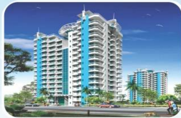
Aims M.G. Grace - Sector 61 (Noida)