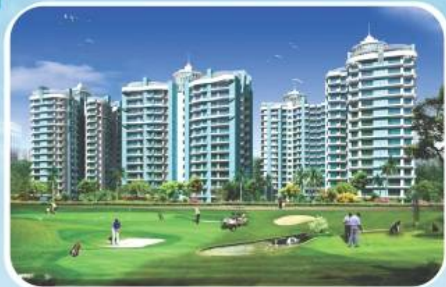
Aims Golf Avenue - Sector - 75 (Noida)