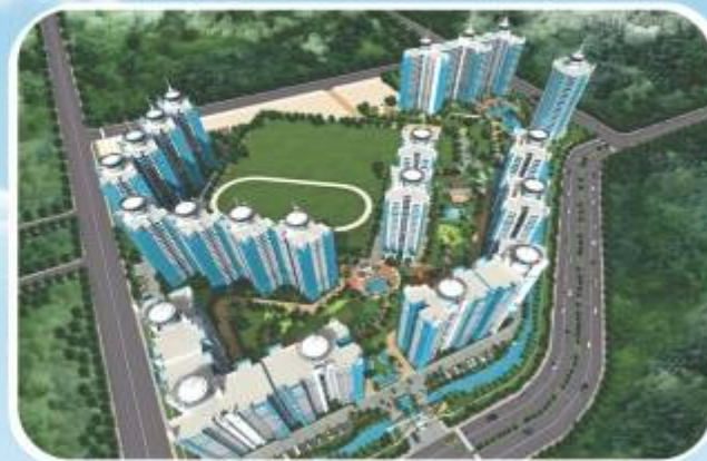
Aims M.G. Glory - Sector-46 (Noida)