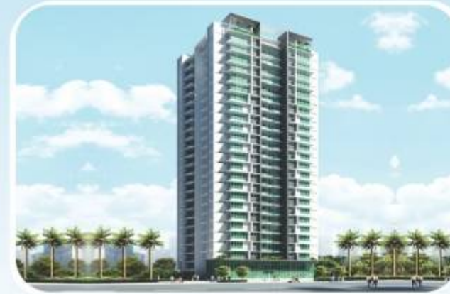
Aims K. White Orchid - Kandivali (Mumbai)