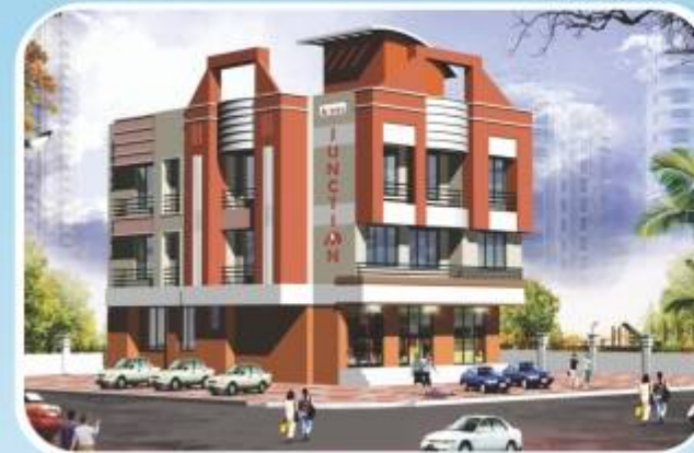
Aims Junction - Bhayander (East), Mumbai