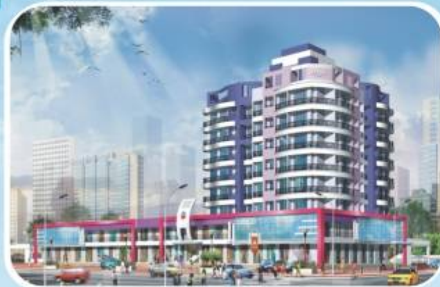
Aims Krishna Dham - Bhayander (East), Mumbai