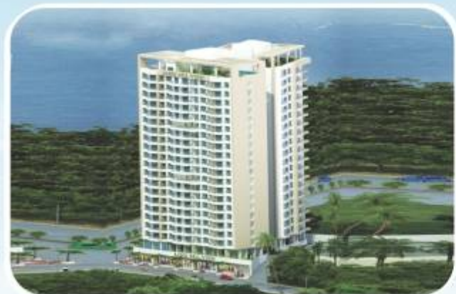
Aims Sea View - Bhavander (East), Mumbai