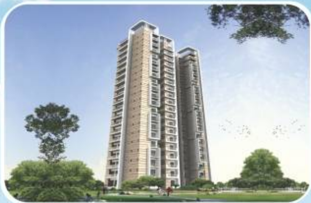
Aims Green Avenue - Gr. Noida (West)