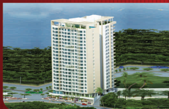
Aims Sea View, Bhavander (East), Mumbai