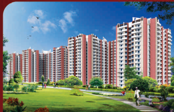
AMG Resi. Complex-II, Plot No 8, Sector 75, Noida