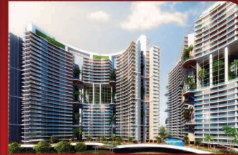
Aims Kamla, Everglade - II, Thane, Mumbai