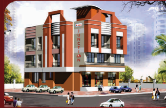
Aims Junction, Bhayander (East) , Mumbai