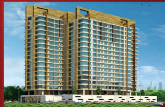
Aims Kamla Horizon - Bhandup, Mumbai