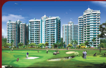
Aims Golf Avenue, Sector - 75, Noida