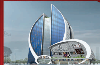
Aims Sania, The Tempean, Sector-15, Noida