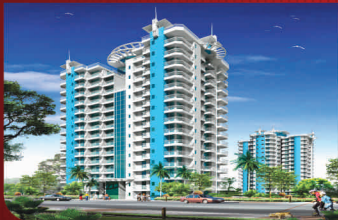
Aims Grace , Sector-61 , Noida