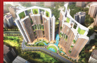
Aims Kamla, Everglade, Thane, Mumbai