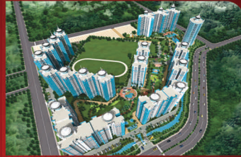
Aims Glory , Sector-46, Noida