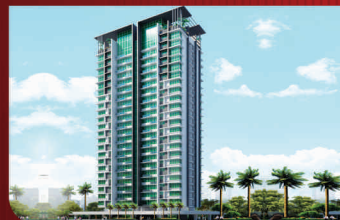
Aims Kamla, Kandivali Charkop, Mumbai