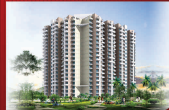
AMG Resi. Complex, Plot No 7, Sector 75, Golf City, Noida