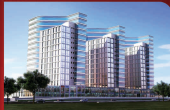
Aims, AMG Noida Business Park, Sector-75, Noida