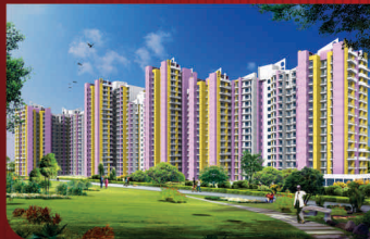
AMG Resi. Complex-III, Plot No 11, Sector 75, Golf City, Noida