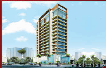
Aims Kamla, Astreya, 10th Road, Juhu, Mumbai