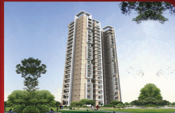
Aims Green Avenue, Gr. Noida West