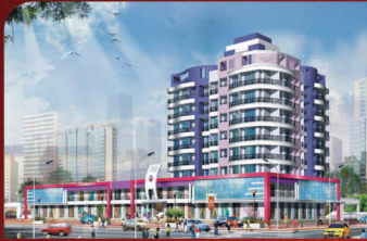
Aims Krishna Dham Bhayander (East) , Mumbai