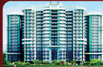
Aims Golf Avenue - II, Sector-75, Noida