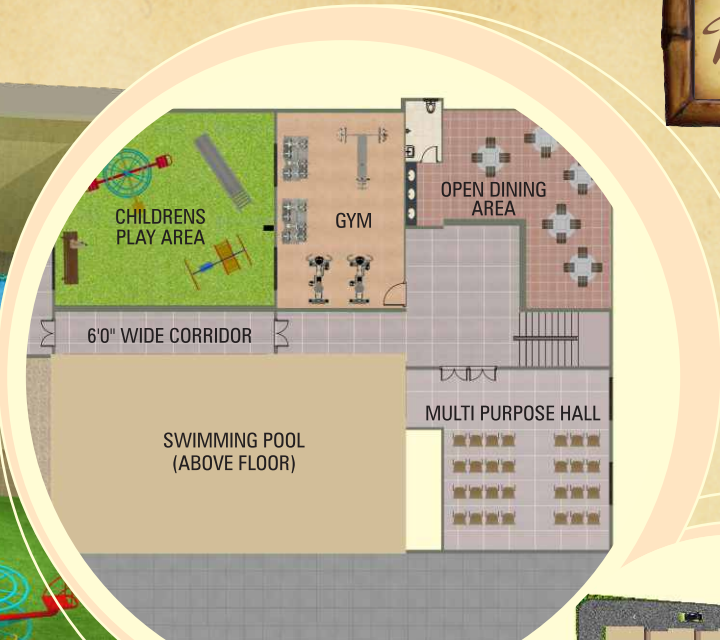
Amenities Plan Ground Floor