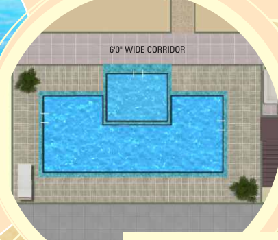
Swimming Pool First Floor