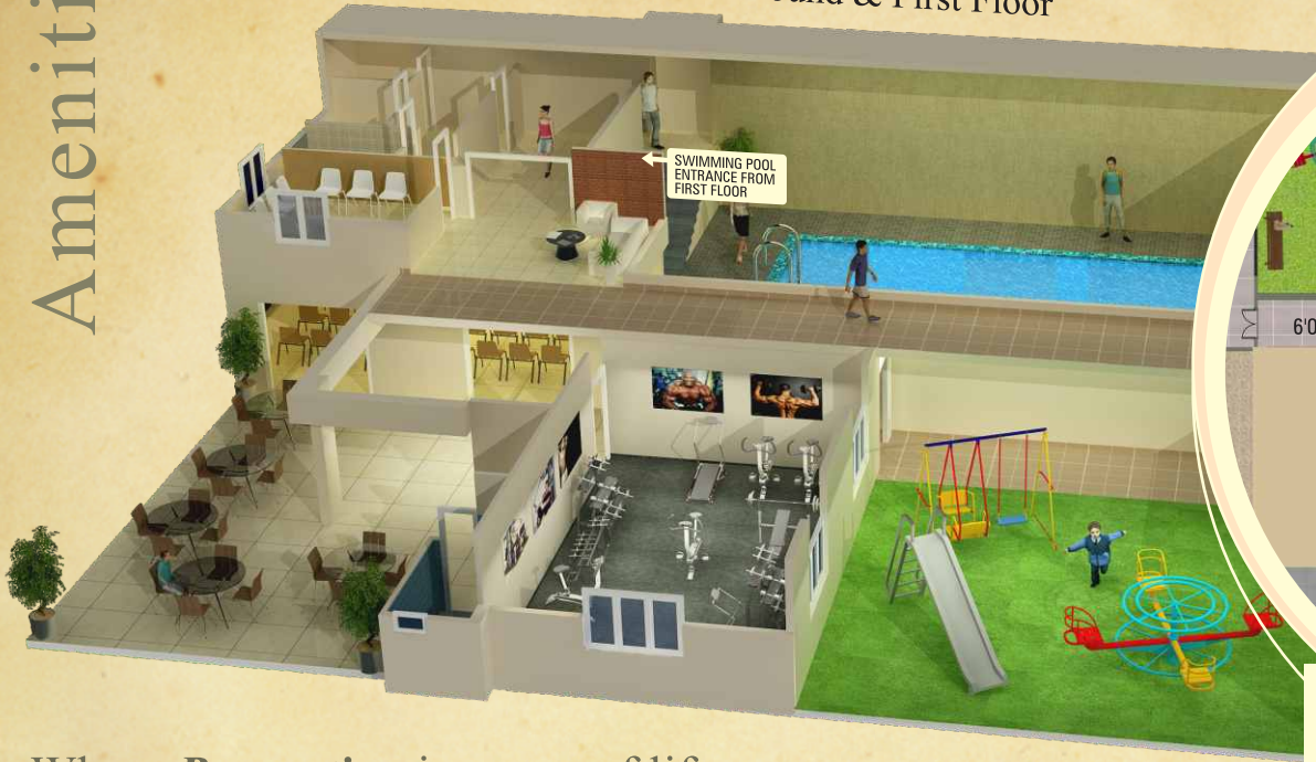
Isometric View of Ground & First Floor