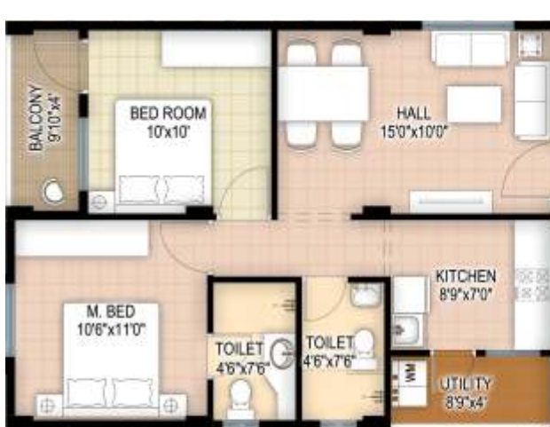
Type : D - 840 sft