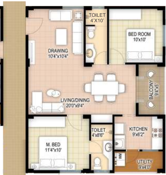
Type : E - 1010 sft