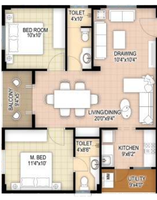
Type : B - 1010 sft