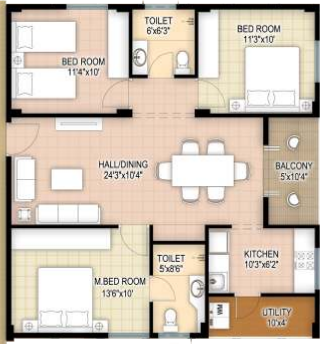
Type : A - 1210 sft