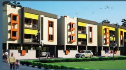
Vinoth Ventura, Porur