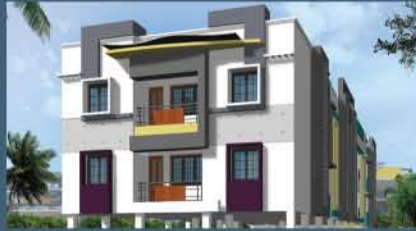
Vinoth Venera, Nerkundram