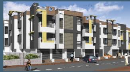
Vinoth Varsha, Thiruverkadu

All our flats designed as per vasthu Loan can be arranged in all leading housing finance institutions