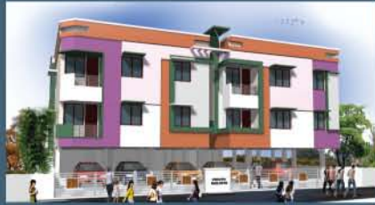
Vinoth Vevina, Nerkundram