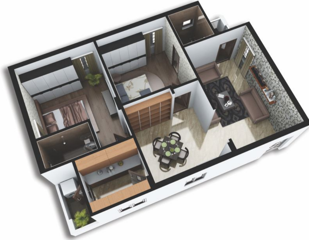
2 BHK East Facing Apartment