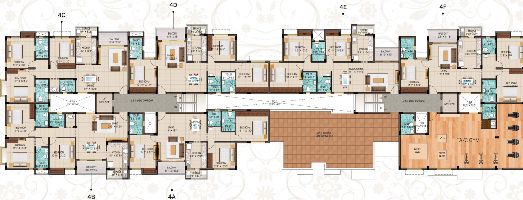
Typical Floor Plan 4 th Floor