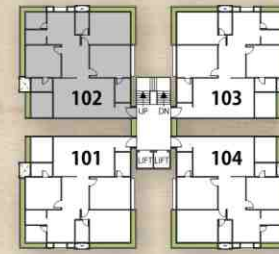
BLOCK - A, B, C