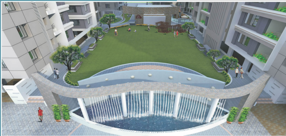
GORGEOUS GARDEN VIEW

It is a home resort where you enjoy holiday 365 days!! life long