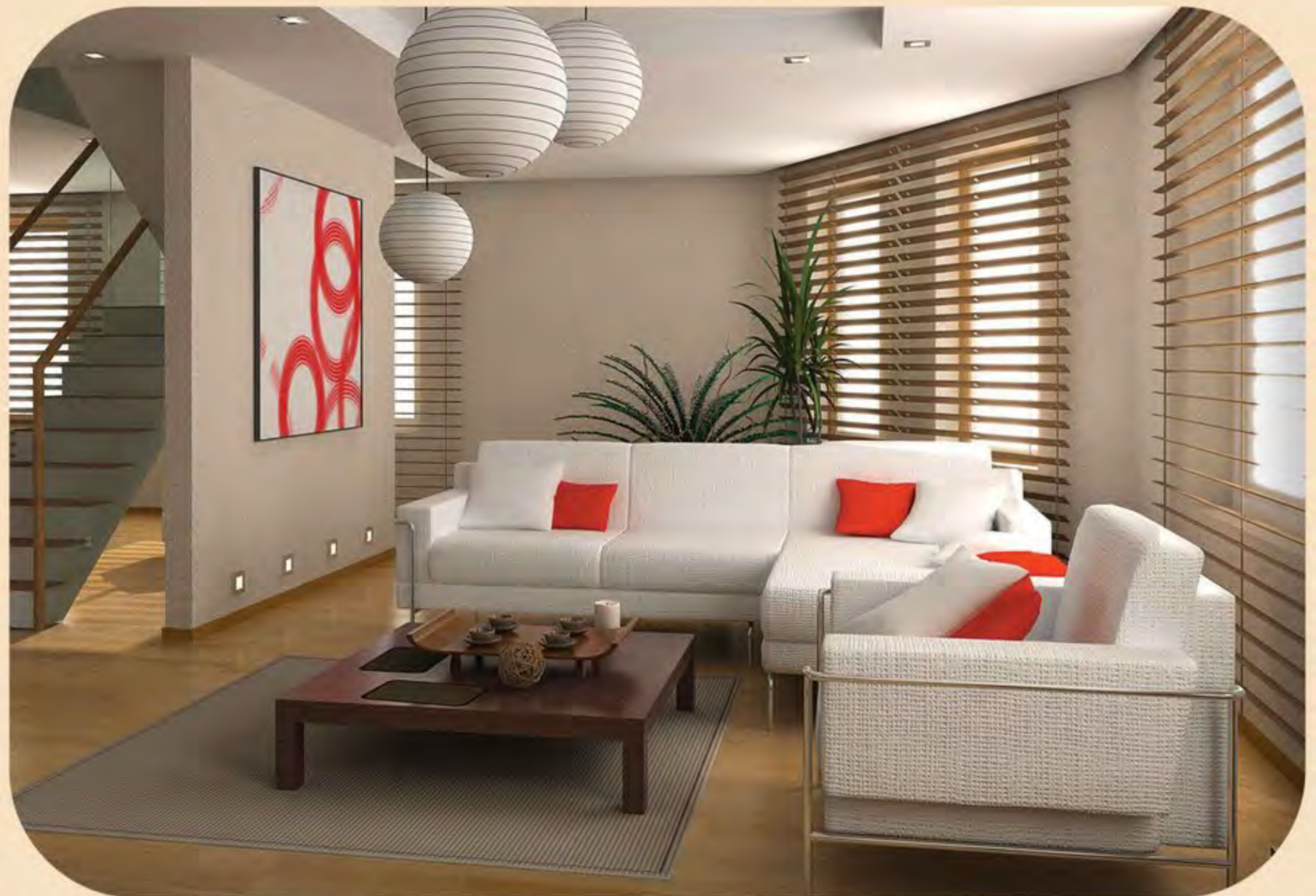
Drawing : Luxurious drawing space to impress your guests and give them most of their comfort