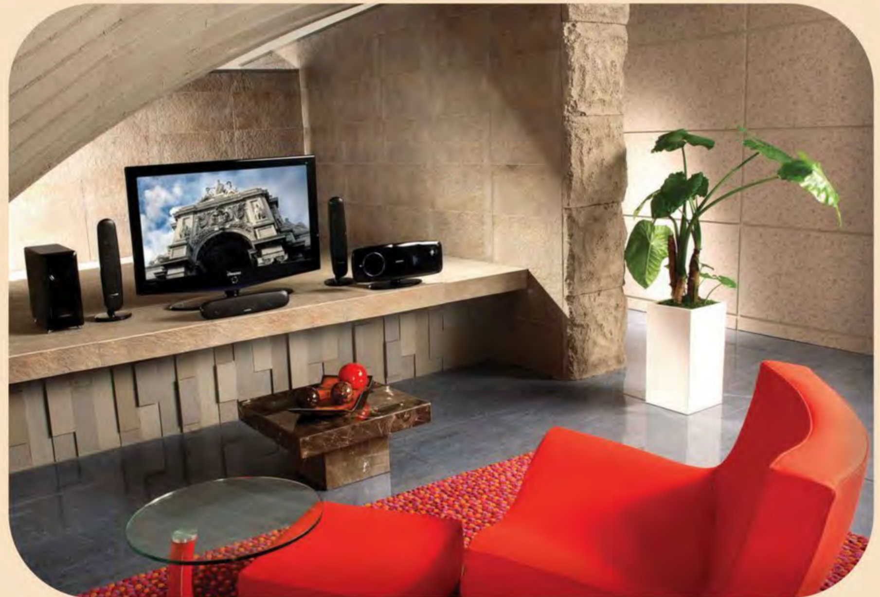
Living Room : Determining the focal point of your living room for you and your family with ultimate living experience.